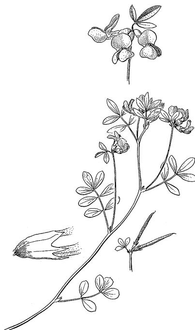
FIGURE 1. Illustration of Lotus formosissimus . (Line drawing from Pojar 1999).

Lotus formosissimus is restricted to the west coast of North America, from southeastern Vancouver Island to central California (Isely 1993; Pojar 1999). In Canada, it is restricted to southeastern Vancouver Island