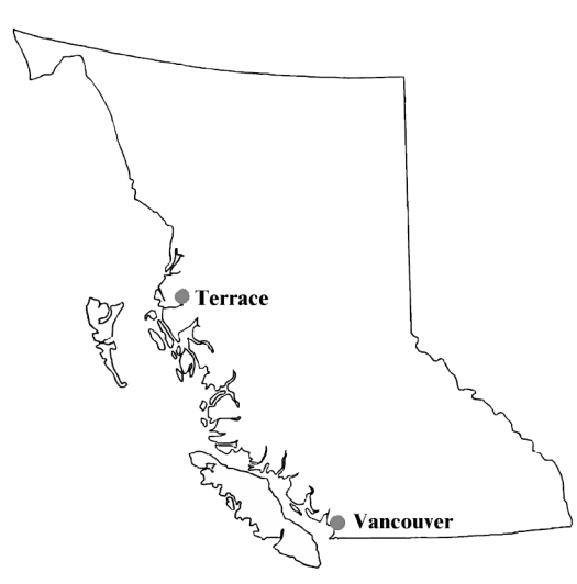
FIGURE 1: Study site location within British Columbia, Canada.

lock, wet submaritime (CWH<sub>ws</sub>) biogeoclimatic subzone (Banner et al. 1993). The second-growth forest consisted primarily of Western Hemlock ( Tsuga het erophylla ), Amabilis Fir ( Abies amabilis ), and Sitka Spruce ( Picea sitchensis ) with a minor component of Western Red Cedar ( Thuja plicata ). The study stands were located on a west-facing slope with gradient up to 40% present. The lower boundaries of the study stands were at approximately 200 m elevation and the upper boundaries were at approximately 450 m elevation.