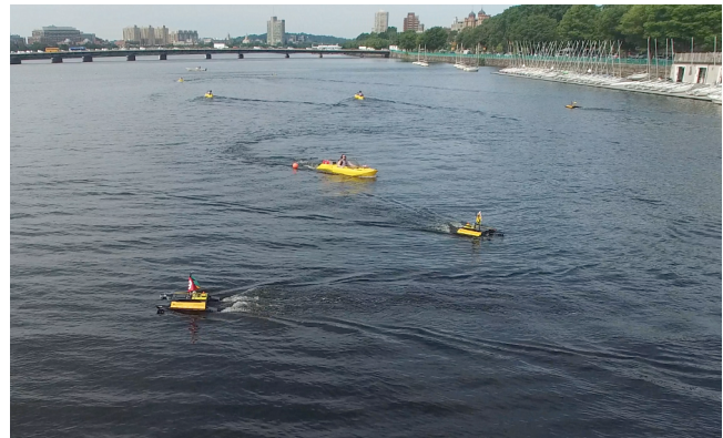
Figure 1: Project Aquaticus: On-water view of vessels.

© 2020 Association for Computing Machinery. ACM ISBN 978-x-xxxx-xxxx-x/YY/MM... $15.00 https://doi.org/10.1145/1122445.1122456