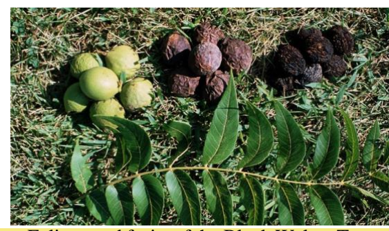
Foliage and fruits of the Black Walnut Tree