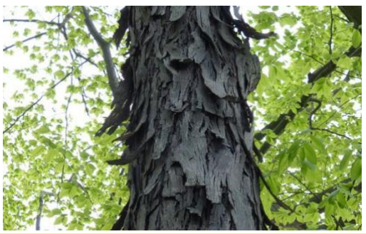
Shagbark Hickory Tree

In a nutshell that completes our brief look at WSU's nut trees. I hope you enjoyed the tour. --Bill