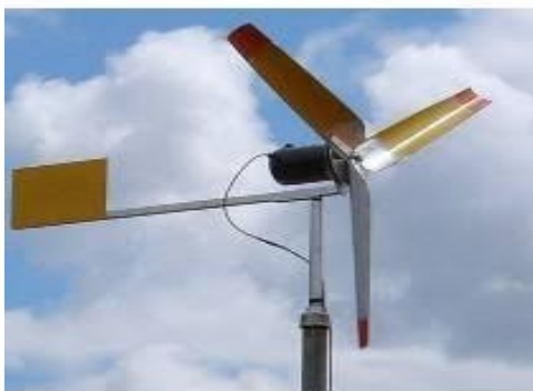
Figure 3: Horizontal Axis Wind Turbine [5]

Implementation of variable wind speed turbines also has been done enables the turbines to get maximum efficiency as the wind varies. Similarly, under varying wind conditions, control strategies are obtained for operating a variable wind speed turbine and the determination of the increase in energy can be achieved using these strategies [13].