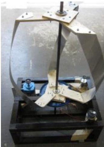
Figure 2: Vertical Axis Wind Turbine- Darrieus type [1]