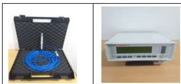
Figure 4: The figure on the left is the PTW-Freiburg’s Farmer type ion chamber of 0.6 cc and on the right is the UNIDOSE E Electrometer.

The Cobalt 60 Teletherapy machine – Bhabhatron – II, a calibrated PTW-Freiburg’s Farmer type ion chamber of 0.6 cc and a UNIDOSE E Electrometer has been used for the experiment as shown in Figure 4. The Bhabhatron II machine’s Gantry, collimator and couch were kept at zero degree. The ion chamber with buildup cap was placed on the couch over a graph paper. The graph paper was used to follow the Cartesian coordinate system for the proper placement of the ion chamber. A 30 \times 30 \text{ cm}^2 field was drawn in the graph paper and the origin “O” on the graph paper was considered as the isocentre or the central ray when matched with the 30 \times 30 \text{ cm}^2 Gamma radiation field. Three markings A, B, C and A 1 , B 1 , C 1 has been put on the either side of the origin “O”, 5 cm apart.