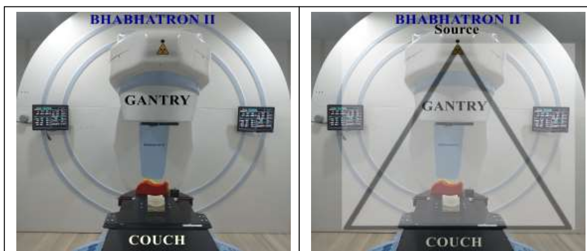
Figure 2: The BHABHATRON II machine at SCI, GMC showing the Gantry and Couch and the picture on the right represents our thought experiment showing Curie’s vision.

A thought experiment was considered to rejustify the above concept. In this experiment, a person named ‘Curie’ with the supernatural power of visualizing the invisible gamma radiation and absolutely free from radiation hazard is standing in the treatment room her location is directly opposite to the gantry. Her eyes are fixed on the source and she is asked to describe the gamma rays emerging from the source. According to Curie, an equilateral triangular shape of diverging radiation beam is visible as she stands face to face with the source as shown in the Figure 2.