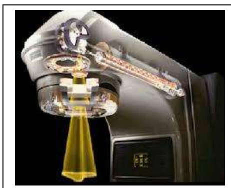
Figure 1: The figure taken from internet showing that the radiation beam coming out of the source follows a conical shape. It is just a schematic representation.

A thought experiment was considered to rejustify the above concept. In this experiment, a person named ‘Curie’ with the supernatural power of visualizing the invisible gamma radiation and absolutely free from radiation hazard is standing in the treatment room her location is directly opposite to the gantry. Her eyes are fixed on the source and she is asked to describe the gamma rays emerging from the source. According to Curie, an equilateral triangular shape of diverging radiation beam is visible as she stands face to face with the source as shown in the Figure 2.