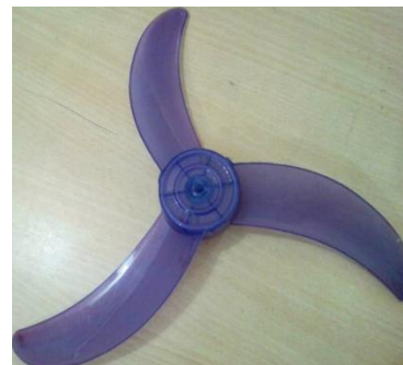
Figure5: Curved light weight blades

The design 4 blade is similar to the design 3 but is made of plastic. This will prevent corrosion. The blades are made little thicker to withstand storms which occurs frequently during monsoon. This blade model is the best model recommend for cities like Guwahati where the wind speed is low. The minimum wind velocity required by this blade is 1.7m/s producing an output voltage of 3.3V.