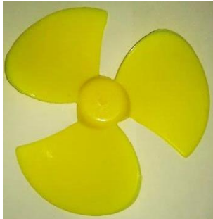
Figure2: Wide blade

The minimum wind velocity required is 2.8-3.0m/s producing a voltage of 3.6V. When the wind reaches a velocity of 4.7-5.2m/s, it produces a voltage of 5.8V.