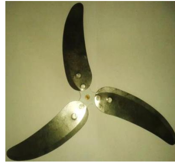
Figure4: Curved slim light weight blade

In this model, the width of the blades is reduced keeping the length and shape of the blade constant. The minimum wind velocity required is 2m/s and produces an output voltage of 2.2V.