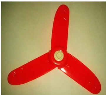
Figure3: Thin straight blade

The minimum wind velocity required is 3.9m/s producing a voltage of 4V. When the wind reaches at a velocity of 4.3m/s, it produces a voltage of 4.64V.