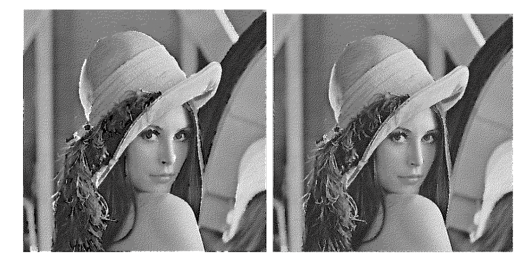
Figure -3: Half tone images of Lena image using Xin-Li's method (a- top left, b-top right) a: Halftone image using edge-stop approach, b: Halftone image using edge-adaptive approach

Figure-2: Halftone images of Lena image using proposed method.(a-top left, b-top right, c-bottom left, d-bottom right) a: Nomral Halftone using Sierra's method b: Halftone image after adding 25% of unsharped filtered image (UFI) c: Halftone image after adding 50% UFI d: Halftone image after adding 75 % of UFI.