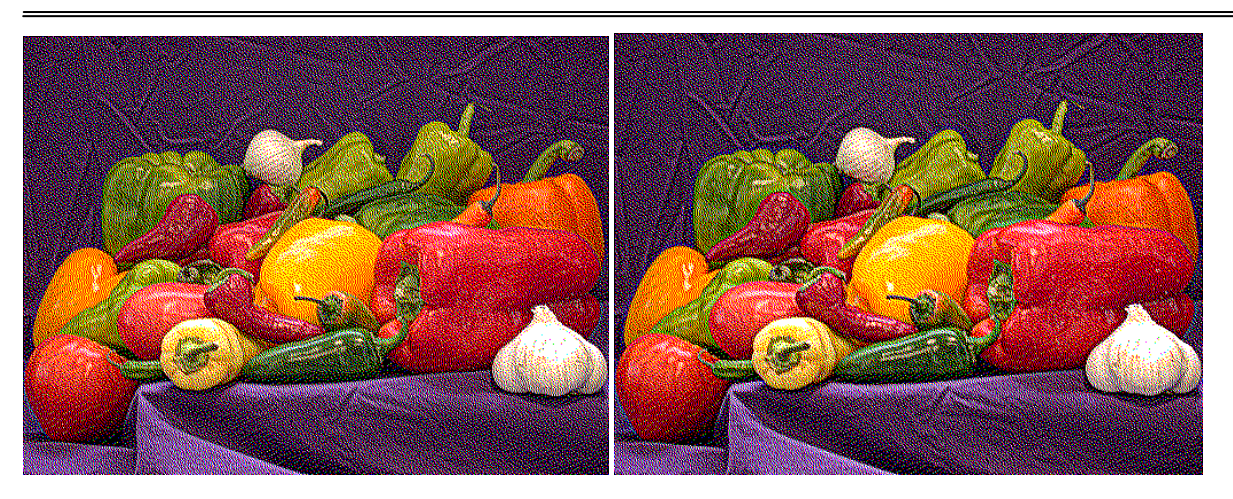
Figure-4: Color halftones of Peppers image (a- top left, b-top right, c-bottom left, d-bottom right) a:. Color halftone using Sierra's Filter lite, b: Color halftone using 3x3 unsharp mask c: Color halftone using 5x5 unsharp mask, d: Color halftone using 7x7 unsharp mask