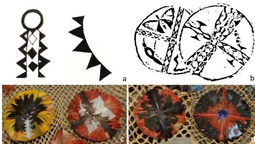
Figure 6. Comparison between decorative graphic elements present on Ticuna masks and mask-shields, with decorative elements applied to hammock trim. a) Serrated motifs present on mawü masks; b) Jiatchines with geometric cross motifs; c) details of decorative elements with serrated feathers; d) details of feathers arranged in a cross shape (a) and b) modified from Gruber 2000, p. 257; c) and d) Museum der Kulturen Basel collection, registration no. Ivc 67).

significance for the Ticuna, serving for experimentations and aesthetic improvements that can later be applied to artifacts of traditional use (Gruber 2000, 255-256). Feather hammocks intended for sale would, therefore, be perhaps one of the first supports of this type for experimentations with the application of a set of graphic elements and colors that could later be inserted into artifacts not for outsiders, but for the Ticuna themselves.