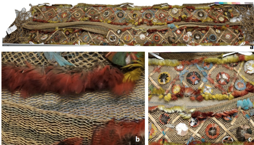
Figure 5. Hammock with feather ornaments housed in the Museum der Kulturen, Basel. a) general view of the object; b) detail of fabric's linkage with row skipping; c) detail of plane flowers' distribution in lozenge-form decorative fields (Museum der Kulturen Basel collection, registration no. Ivc 67).

The trims have a square weave of the varanda type. There are two pre-assembled feiras of red and yellow feathers tied at the base by a cord (Ribeiro 1988), sewn directly onto the trim; one on the limit with the cloth, and another giving the border a finish.