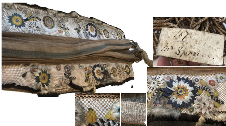
Figure 1. Hammock collected by Richard Spruce housed in The British Museum. a) general view of the conservation state; b) label with the original number of field collection (167) and Spruce's name; c) detail of trim; d) detail of fabric formed by distinct colored bands; e) detail of the different feather flowers and the black and white feather strips that finish the edge of the trim (The British Museum collection, registration no. Am1960,10.92).

In the flower-shaped feather ornaments applied over the trim, it is possible to verify transformation techniques of the plumes and feathers (Schoepf 1985), whose edges, in some cases, are cut in order to reinforce the desired acute angle for the petals. The flowers are assembled separately and glued one-by-one using latex to the fibers of the trim, presenting a great variety of sizes, textures and color combinations. Black feathers cut horizontally are previously tied together, forming a long sequence of feathers called feira that is then sewn on the border of the trim. This black feira is overlapped by a white feira of plumes glued on the fibers, finishing the edge of the trim by composing a contrasting chromatic set (Vicente 2018, 33). Black and white festoons feathered by the rosette technique (Ribeiro 1986) form tortuous paths that connect the flowers, creating a spring-like aesthetic that resembles interwoven vines.