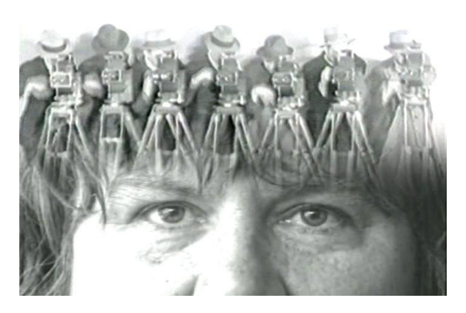
Figure 2: Source - Gringo in Mañanaland, by DeeDee Halleck (1995). Courtesy by DeeDee Halleck.

order back; and "Partners", the Good Neighbor Policy to keep the desired order. The sequences of the films are distributed within each segment of Gringo in Mañanaland to reveal the ideological content of the narratives, thus, neutralizing their power to deceive, as their images are presented out of the original context.