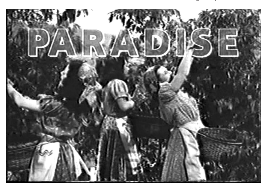
Figure 4: Source - Gringo in Mañanaland, by DeeDee Halleck (1995). Courtesy by DeeDee Halleck.

Contrastive with the collage of film segments which convey similar ideas about Latin America, Halleck also elaborates a critique of the exploitation of Latin America by the USA in her handling of starkly contrastive sequences from older movies. The juxtaposition of a TV film about the Pan American conference in Washington in 1930 with the sequence of Carmen Miranda in The Gang's all Here (1943) makes evident the American policy of establishing a good-will pact with its neighbors moved by political and commercial interest. The image of Carmen Miranda with her hats, bananas and with all the excess of the spectacle, and which is associated with Latin America as a land of richness, shows to the spectator the real economic interest behind the diplomatic meetings between presidents and secretaries