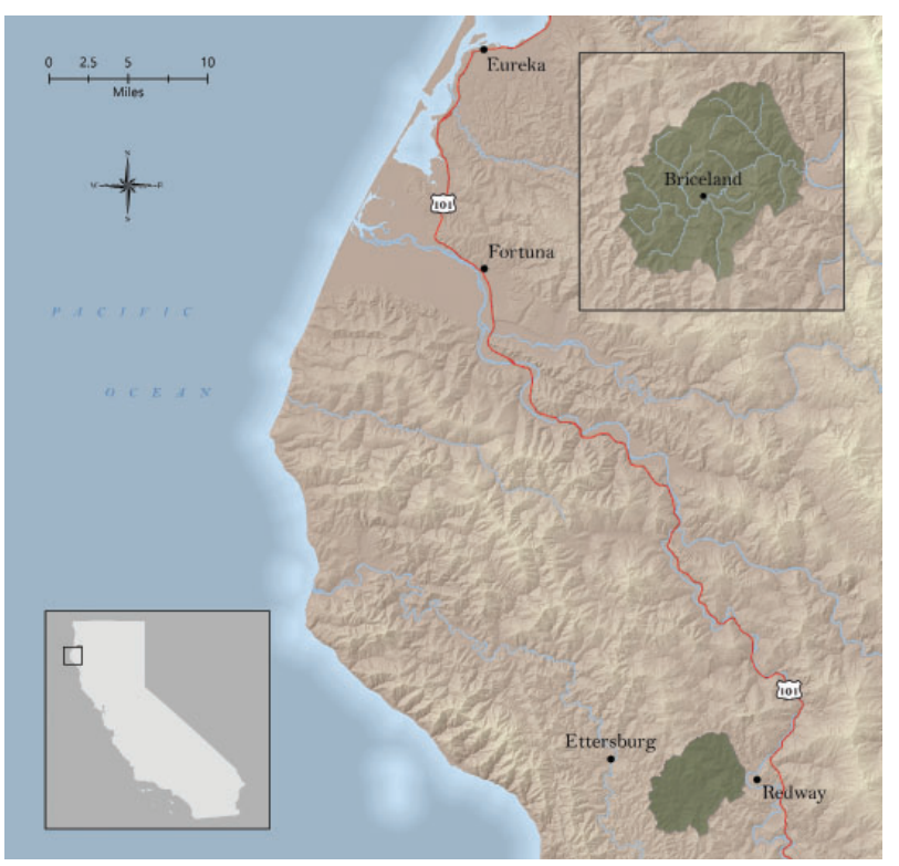
Figure 1. Location of the Redwood Creek watershed, in southern Humboldt County. Detailed view, upper right inset; view within California, lower left inset (sources: USGS Earth Explorer, County of Humboldt, California Department of Forestry and Fire Protection; map by author).

is to provide a case study of the Redwood Creek watershed (Figure 1)—one of the first places where the back-to-the-land movement became entrenched, and exemplary of numerous areas where ranching and timber extraction have largely given way to unregulated, commercial-scale marijuana cultivation.