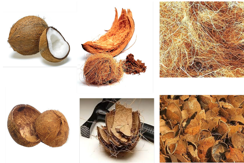
FIGURE 2. Waste coconut fiber and coconut shell.

The specific objective of this research to find alternatives substitute of fine and coarse aggregates on paving blocks using coconut fiber and shell so that it can raise some issues such as how many percentages of mixed substitution is needed to achieve the compressive strength as the minimum standards allowed for the parking area, and percentage permeability and porosity. Knowing whether the selection of fibers and coconut shell as coarse aggregate can replace the main material is a fine aggregate (sand), and coarse aggregate (gravel) on the mix design paving blocks up to 100%.