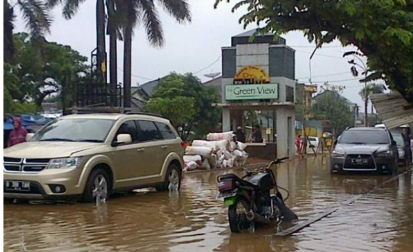
FIGURE 1. Flooding in the parking area.