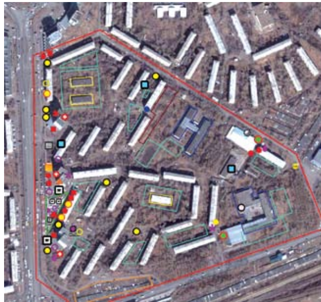
Fig. 4. II “Predmostniy (Bridgehead)” micro-district in Krasnoyarsk. The scheme of functions concentration

Humane residential space is not only a comfortable residential cell. Residential environment is regarded as an outward, supplementary part of a habitat including the territory near the house and public gardens, streets, lanes, yards where people’s everyday and recreational demands are satisfied