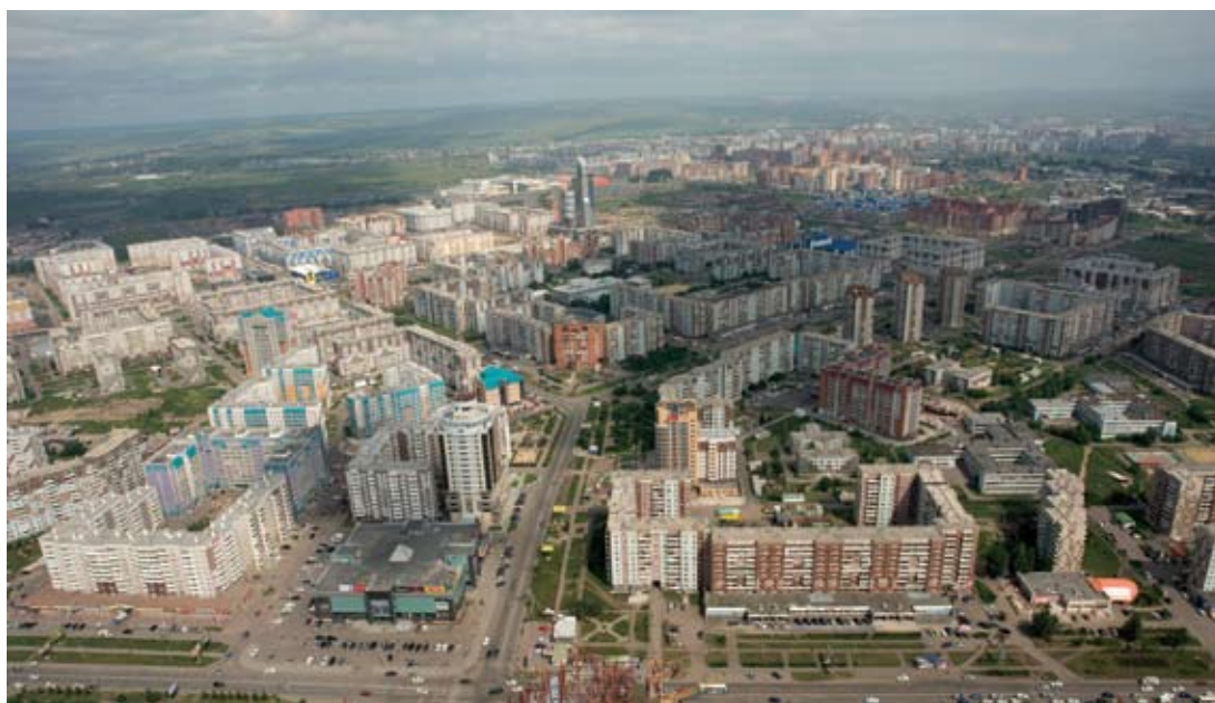
Fig. 5 The residential environment site of the “Airport” planning district, Krasnoyarsk. Modern state

enterprises and “selectivity” towards work are observed. These result in substantial changes in the places of work structure. At the beginning and in the middle of the century “work” was mainly associated with industrial territories. Otherwise, by the end of the century the rate of the employees in the spheres of administration, service, science, recreation industry sharply grew in number. That involves the breach of working places proportions and consequently the population’s everyday inner migrations according to “working place – home” scheme. A micro-district connection with a working place turned out to be groundless, depriving a person of the right to choose. Urbanization is no more directly dependent on industrialization; scientific production, service, administration and cultural branches development is the most important source of large cities growth; a city’s multifunctionalism becomes its main feature. It is in the 1980-s when they started speaking about the necessity of the mechanisms that provide