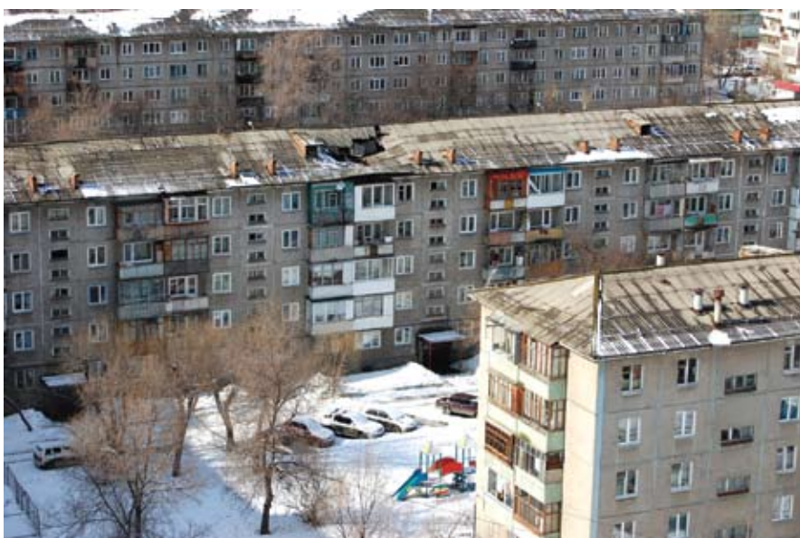
Fig. 3a. An industrialization epoch micro-district view: present state

into zones and on a stage system of service that was criticized by professional architects in the 60-s already. The system of a three-stage service was criticized for its inability to “programme” an individual’s behavioral aspect. Numerous research at the beginning of the 70-s proved that the population used on-the-way-home or on-the-way-to-work services more willingly. That’s why transit junctions and public transport stops at the places of work more often determined the choice of sites for large trade and public structures. Speaking about a tough “everyday life – work – leisure” doctrine, the critics observed that in reality a city serves a single material-and-spatial environment in which complex industrial, cultural and everyday processes take place. Due to them people of different social and demographical strata are involved in various relations, in life of various groups and communities and do not isolate in one territory or a city’s functional zone. “The minimalist approach and a three-stage service in micro-districts at the end of the 50-70-s of the XX century resulted in a spontaneous formation of both social-business-trade and