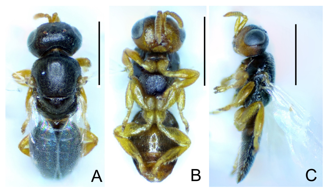
Figure 3. The general habitus of M. seefelderiana (♀): A – dorsal view, B – ventral view, C – lateral view. Scale bar = 1 mm.

We hope that this paper will encourage further research and provide relevant insights into the relationship between the mantis and the presented pseudoparasitoid.