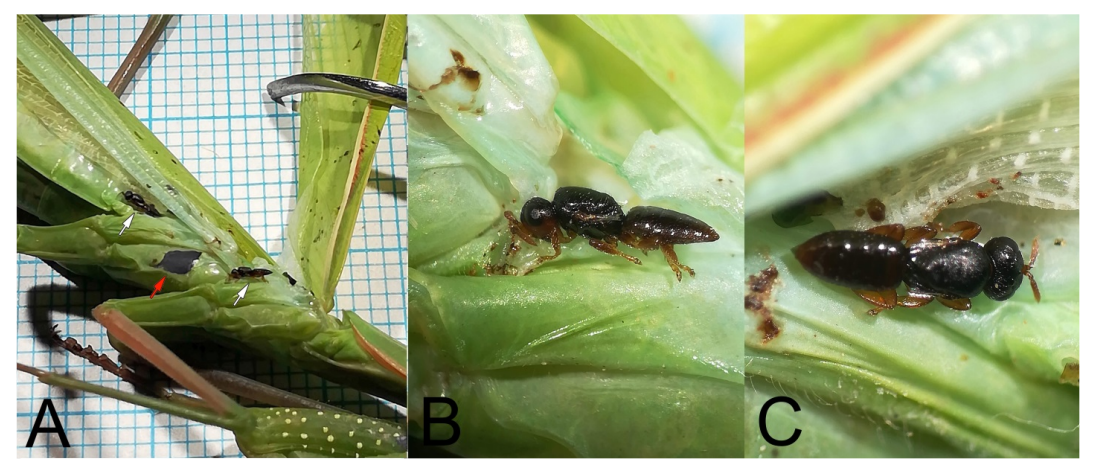
Figure 1. The adults of M. seefelderiana parasitizing the European mantis externally: A - two pseudoparasitoids on the same host (marked by white arrows) and the black dot on the host body (marked by a red arrow), B and C – enlarged pseudoparasitoids and the traces of damages on the host body due to pseudoparasitoid feeding.

While keeping the female mantises infected with M. seefelderiana in the plastic boxes, we were able to follow the mantis oviposition and the simultaneous parasitism of the newly formed ootheca (Fig. 2A) which we recorded by video. Figure 2B shows the exit holes of the pseudoparasitoids on the ootheca (openings are indicated by arrows). On the longitudinal section through the ootheca (Figure 2C), it can be seen that the upper row of eggs in the ootheca is infected with pseudoparasitoids, dark exuviae of the parasitoid larvae and some dead adults. From the lower row of eggs, mantis nymphs emerged.