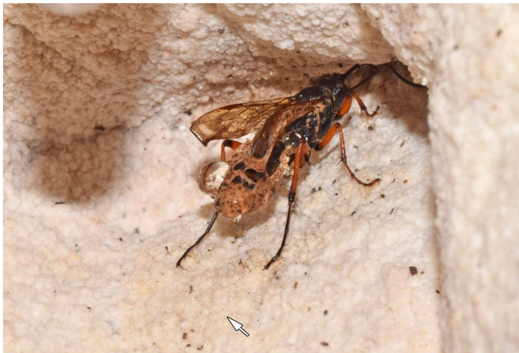
Figure 3. A dead female of the four-spotted cave ichneumon wasp, D. quadripunctorius , found in Devojačka Pećina Cave. A white arrow indicates the stained cave wall, probably a result of the aggregation of conspecific specimens during the winter.

In the chamber of Ogorelička Pećina where we found the wasp specimens, the measured air temperature and air relative humidity were 13°C and 60%, respectively. Close to the collecting place in the cave we saw the remnants of adult lepidopterans, suggesting that they also enter the cave close to the entrance. As all our findings of D. quadripunctorius were accidental (we were not searching for them in a targeted manner), we do not know when this species entered the caves from the open environment. According to Baird & Shaw (2019), its presence in caves and mines was recorded from the end of July to late April. It is most likely that this parasitoid harmonizes its life cycle with that of its hosts due to the diapause of the latter, which are also looking for overwintering shelter.