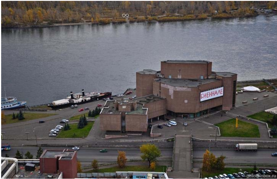
Fig. 2. A.S. Demirkhanov, Krasnoyarsk Cultural Historical Museum Complex

urban composition. Clearly distinguishable from very distant spots the sealed museum volume is a dominant of the vast waters of the Yenisei River, which is emphasized by the author's idea of raising the volume, "which is seen well even from the most distant bridge" (Tarasova et al, 2008).