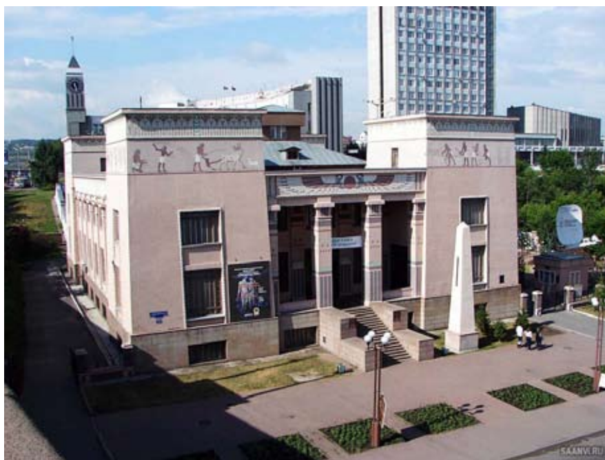
Fig. 4. L.A. Chernyshev, Krasnoyarsk Regional Studies Museum

Regional Studies Museum (Fig. 4). The building was designed as a three-story building made in the Egyptian style. The reason for the location of the museum – on the bank of the Yenisei River – was that the building built at the intersection of Dubrovinskogo and Weinbauma Streets was to stand out from the side of the Yenisei River and the railway line. During construction of the museum the Kommunalny Bridge was not there, it only appeared in 1961 connecting the right and left bank. The bridge was built in the immediate vicinity of the museum blocking and suppressing it. But at the beginning of the 20th century this urban element was not there yet, so the building was visible and open.