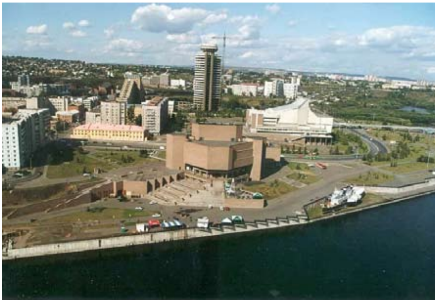
Fig. 3. A. Demirkhanov, Mira square

the architectural thought manifested in the form of assimilation of the roof slopes to the mountain ranges, the division into two volumes, the large and the small ones, thereby giving the person a choice to stay in the chamber space or be included into something more – the universal. A. Demirkhanov says the following: “The face of the city is the people’s attitude towards nature, the ability to understand the world around them. We strive to create such ensembles that have a particular Siberian character of the city so that the glass and concrete do not dominate over wildlife, but harmonize with the Yenisei banks” (Dmitrienko, 1982).