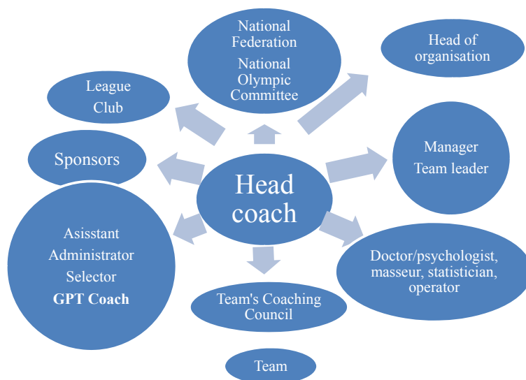
Fig. 1. Position of a coach in the overall team management system in volleyball

These definitions are more applicable and correct for the coaches who train teams of high