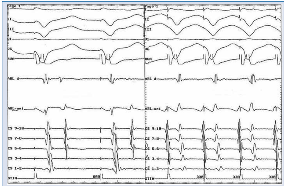
Figure 2. Right ventricular apex pacing in different cycle length shows 1:1 VA conduction with earliest retrograde A wave in ablation catheter which is placed in the His position.