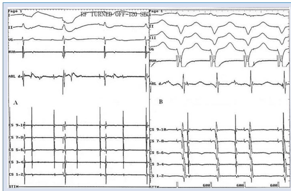
Figure 3. A. Complete atrioventricular block after successful left lateral accessory pathway ablation; B. VA dissociation during right ventricular apex pacing (drive cycle length = 600 ms).

lateral AP ablation is intra-atrial conduction block [2]. This barrier after radiofrequency ablation can change retrograde left atrial activation without any effect on the main arrhythmia mechanism or primary accessory pathway conduction. In typical right atrial flutter, the anatomic and electrophysiological substrates (cavotricuspid isthmus) have been well de-