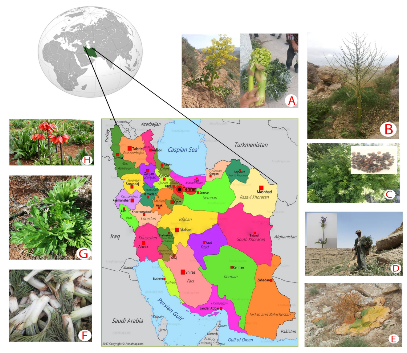
Fig. 3. Selected rare and endangered medicinal plants of Iran: (A) Ferula latisecta Rech.f. & Aellen, an endangered medicinal species occurs in NE of Iran; (B) Dorema kopetdaghense Pimenov, an endangered medicinal plant found in NE of Iran; (C) Ribes khorasanicum Saghafi & Assadi, an endangered medicinal species occurs in a small area in NE of Iran; (D) Nepeta binaloudensis Jamzad, a highly endangered medicinal plant found in NE of Iran; (E) Rheum turkestanicum Janisch., a rare important medicinal plant distributed in NE of Iran; (F) Dorema aucheri Boiss., a threatened medicinal plant found in the western region of Iran; (G) Kelussia odoratissima Mozaff., a threatened medicinal species occurs in a small area in the western part of Iran; (H) Fritillaria imperialis L., a threatened medicinal plant distributed in the western region of Iran; (H) Fritillaria imperialis L., a threatened medicinal plant distributed in the western region of Iran; (H) Fritillaria imperialis L., a threatened medicinal plant distributed in the western region of Iran; (H) Fritillaria imperialis L., a threatened medicinal plant distributed in the western region of Iran; (H) Fritillaria imperialis L., a threatened medicinal plant distributed in the western region of Iran; (H) Fritillaria imperialis L., a threatened medicinal plant distributed in the western region of Iran;

natural plant products. Evaluating and monitoring potentially detrimental substances are indispensable for improving the general quality and safety of extensively employed medicinal herbs.