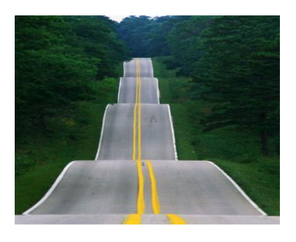
Fig. 5: Uphill downhill road

Then, the data is recorded. This experiment will be conducted 3 times for each type of fuel to get more accurate results. For the fuels we use PETRONAS brand from PETRONAS station. For the type of road, highway we choose SPA highway. Then, for domestic road we choose Ayer Keroh domestic road. Lastly for uphill and downhill road, we choose Balik Pulau road at Pulau Pinang in Malaysia.