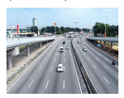
Fig. 3: Highway road

Next, the test will be conducted at the different type of road, which is highway, domestic and uphill/downhill.