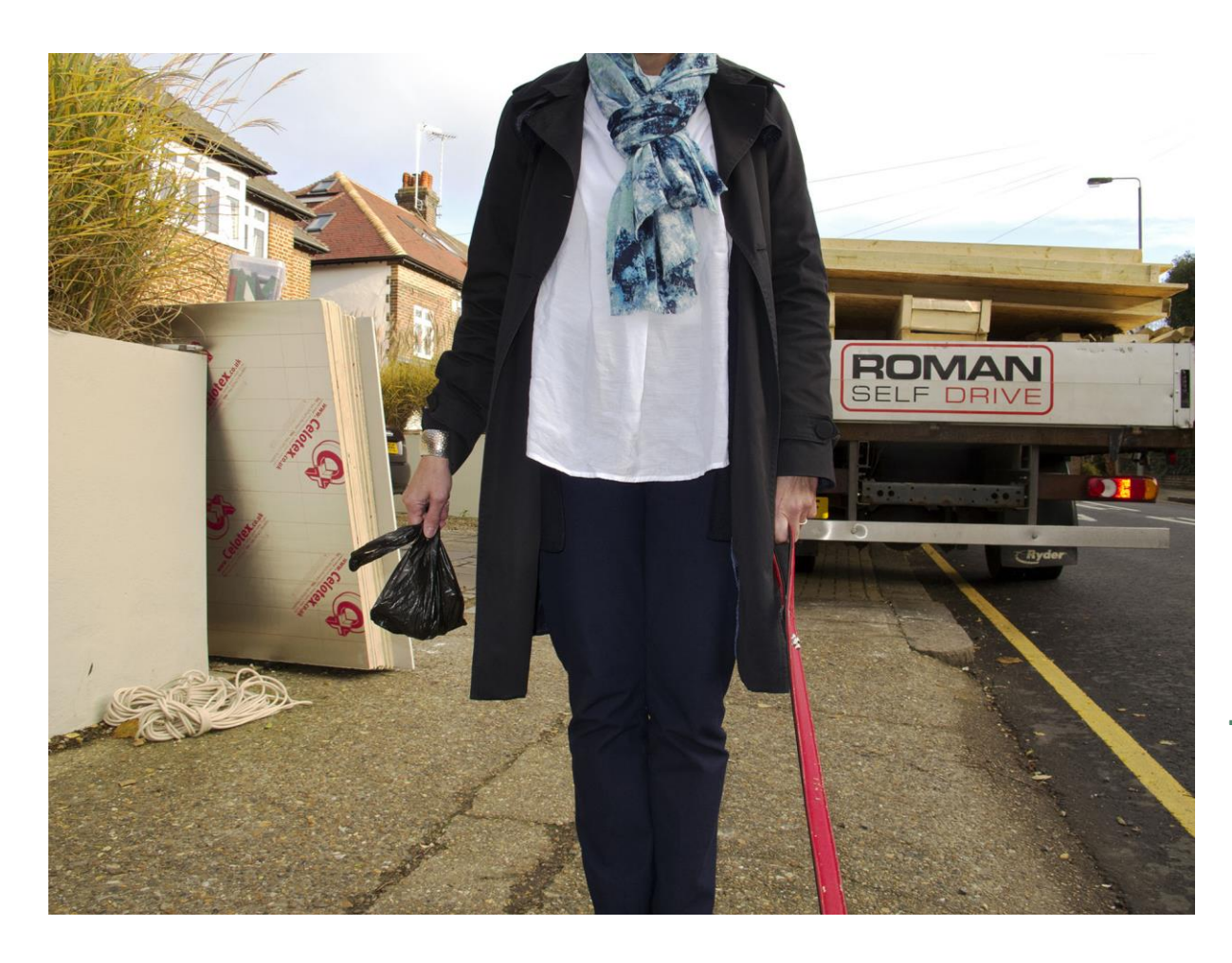
Wandsworth, UK (2016)

we can only undertake such selfless acts with a creature for which we have a mutual love and affection; but that also asks questions about the nature of using plastic bags to achieve the objectives of keeping areas where dogs are exercised faeces free and wondering if there isn't a better way to deal with a situation where the solution has become a far bigger, international and more long-term problem than the one it was meant to solve.