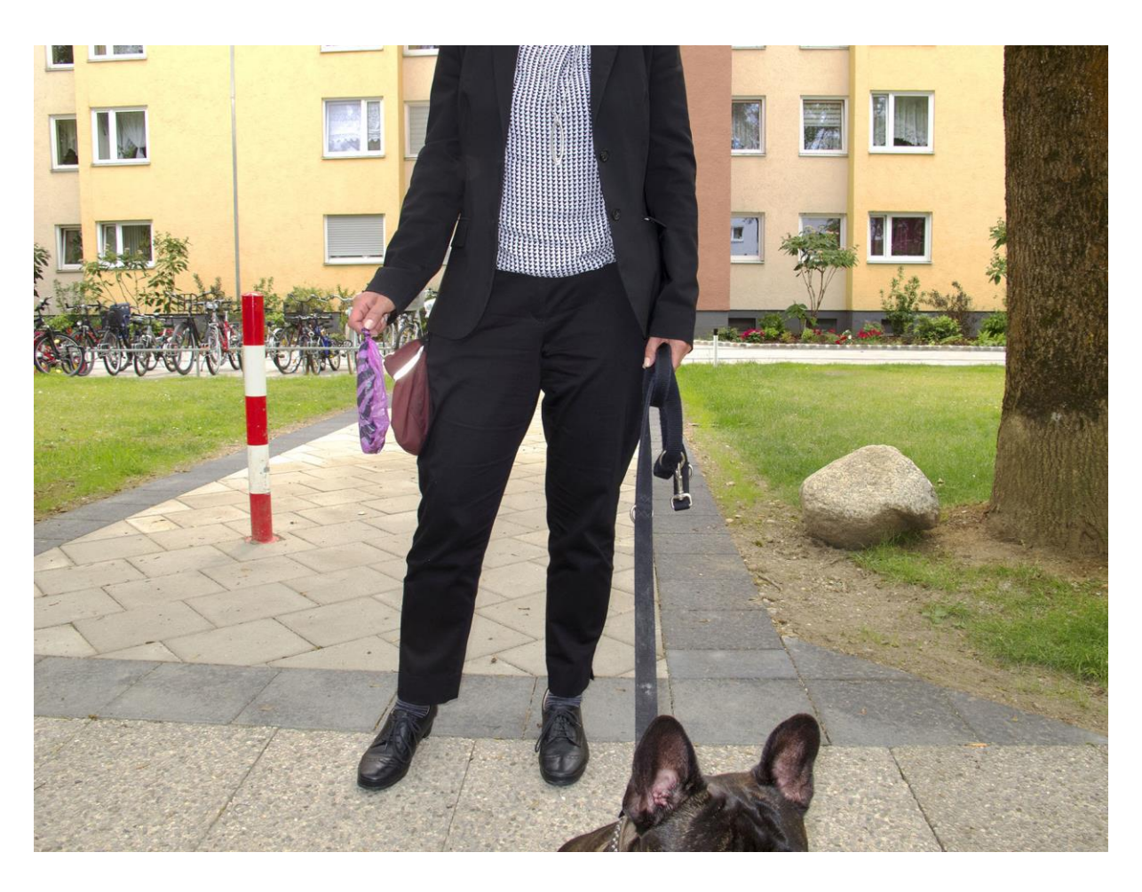
Munich, Germany (2017)