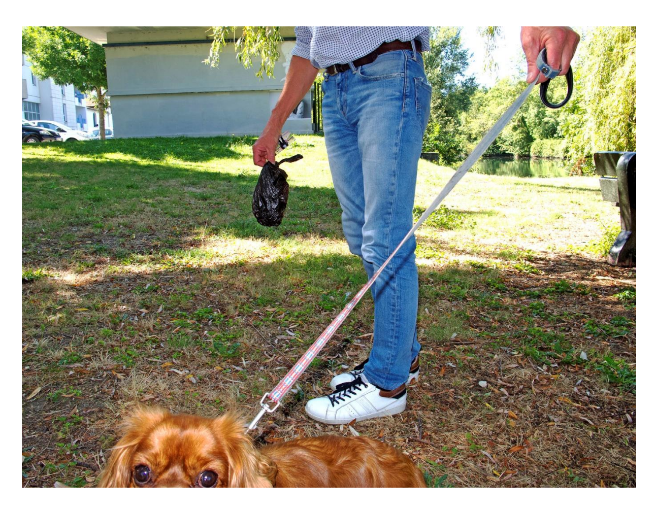
Angouleme, France (2018)