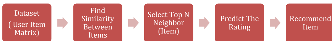
Figure 2. Recommendation Process

Based on this predictive rating, the system considered to recommend it to user or not. The higher the predictive rating leads to the greater the chance that the item will be recommended to a user. In general the recommendation process that use item-based collaborative filtering approach can be depicted in Figure 2 [7]. This research followed this process.