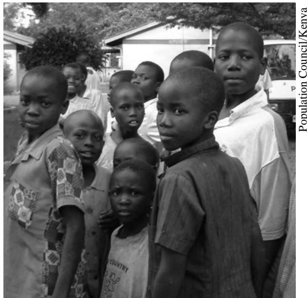
Youth outside district health center, Busia, Kenya