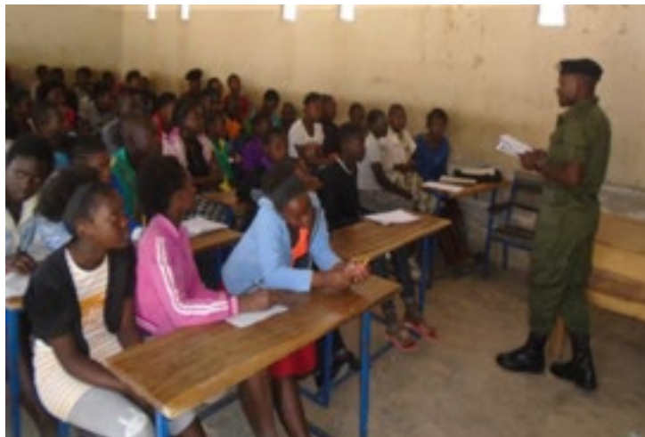
Child protection awareness.

Cognizant of the challenges already discussed in the communities where the program was implemented, ZAMFAM invested in several interventions aimed at improving livelihoods for program beneficiaries. Health and HIV-related challenges arising from adolescent pregnancy, prostitution, and early marriages were previously identified as challenges. Child protection services were also available to address issues linked to early marriages and sexual abuse in addition to psychosocial counseling and other services. Additionally, in addressing unemployment and education challenges, economic strengthening approaches and providing educational support responded to community needs. Child protection services also provided trainings for OVC caregivers to address some of the