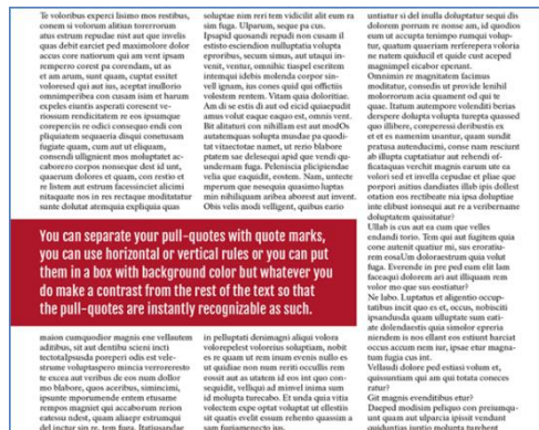
Figure 2. Pull-quotes, Magazine Designing

This suggests that visualisation has become the new aesthetic in what Massumi terms the feelingvision dimension (cited in Lupton and Miller, 1999). Images as visual stimulation form have immediacy and allure, improving desire to engage. The focus group respondents stated they were primarily attracted by the coloured type element, while white spaces surrounding the text catch attention.