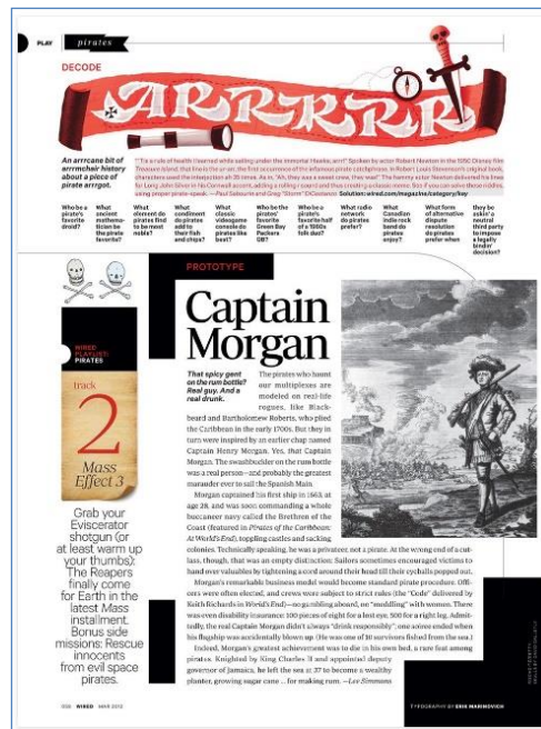
Figure 5. Pirate Magazine Page in Wired

From the question of comfortable for reading, all survey respondents voted for Calibri (Figure 4) as the type font they prefer for the purpose of reading. This shows an overwhelming preference for typefaces which are clear, legible and comfortable to read.