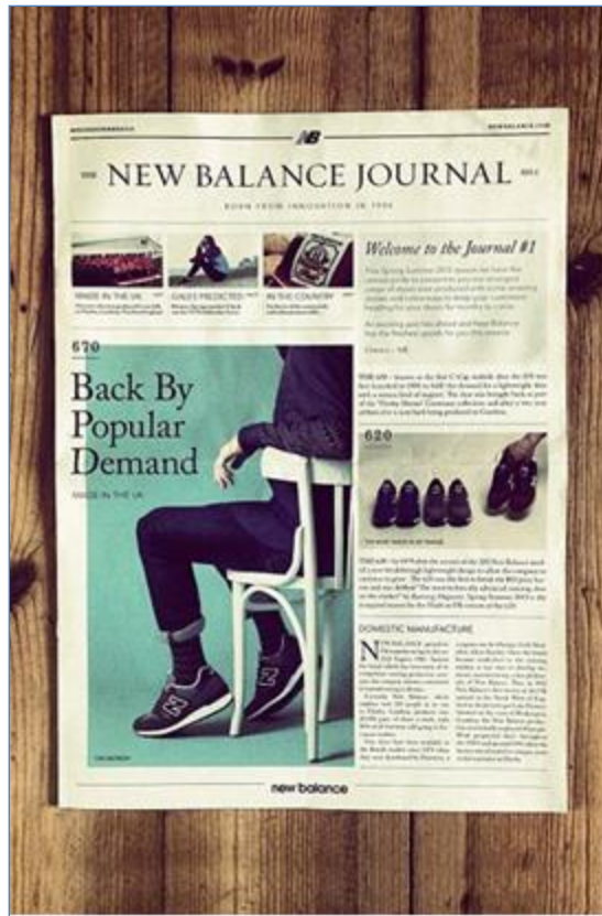
Figure 1. Cover Page, the New Balance Journal 1

This suggests that visualisation has become the new aesthetic in what Massumi terms the feelingvision dimension (cited in Lupton and Miller, 1999). Images as visual stimulation form have immediacy and allure, improving desire to engage. The focus group respondents stated they were primarily attracted by the coloured type element, while white spaces surrounding the text catch attention.