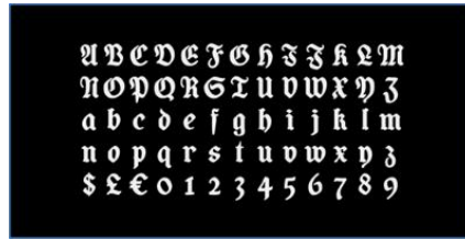
Figure 3. Coop Blackletter

Question subsequent asked respondents to choose between two type fonts, Blackletter (Figure 3) and Calibri (Figure 4) for the purpose of reading, Blackletter’s cursive hand-lettered form is an antiquated typeface from the European Renaissance era, originating from the Latin script system, while Calibri font has subtly rounded stems and corners; the modern type is clearly observable at larger sizes and distances, even for casual reading.