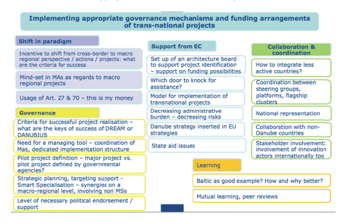
Figure 4. Result of the mind mapping sessions.

Afterwards, a "Pro-Action Café" session was performed as an innovative yet simple methodology for hosting conversations on the concrete questions and issues identified during the previous sessions. It was executed in the form of six round table conversations (see Figure below) between participants on the concrete issues identified during the previous sessions evoking the collective intelligence in pursuit of the common aims.