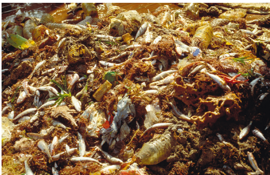
Fig. 2.1 Litter collected by trawling in the Mediterranean Sea, France. 10 min experiment