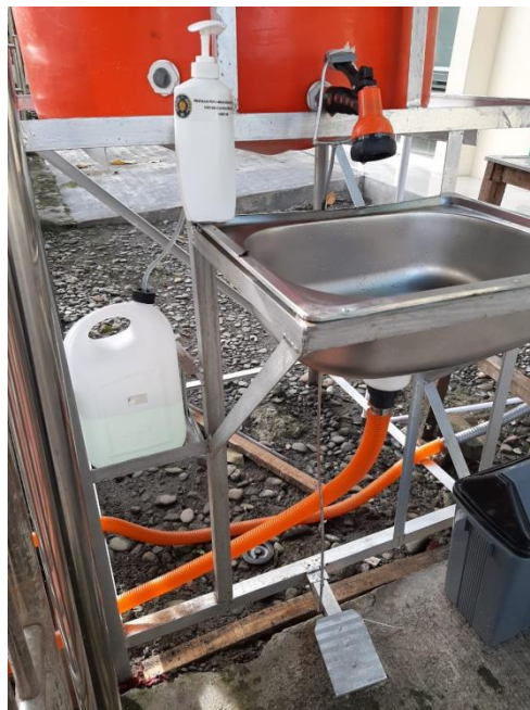
Figure 5. Foot pedal position in the hand wash basin

Controlling water through the aforementioned is mostly by the use of the hand to operated water tap. Because the manual control tap mostly involves touching of the tap handle to allow and stop water flow, it has the problem of the hand after using them. The issue of contamination of Virus Covid 19 is very serious and it means that the intention of hand wash being used as a means of protecting public health will not be realized. With foot operated valve in this wash basin makes it better compared to the hand operated valve. Because it also can self- return so that water is not wasted because of forgetfulness to close tap. (Adzimah and Agbovi 2015)