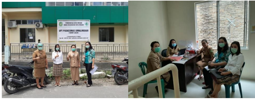
Figure 2. (Left) The academic team having a visit to the Simalingkar Public Health Center, (Right) The design of the hands free wash basin were discussed with Partner.