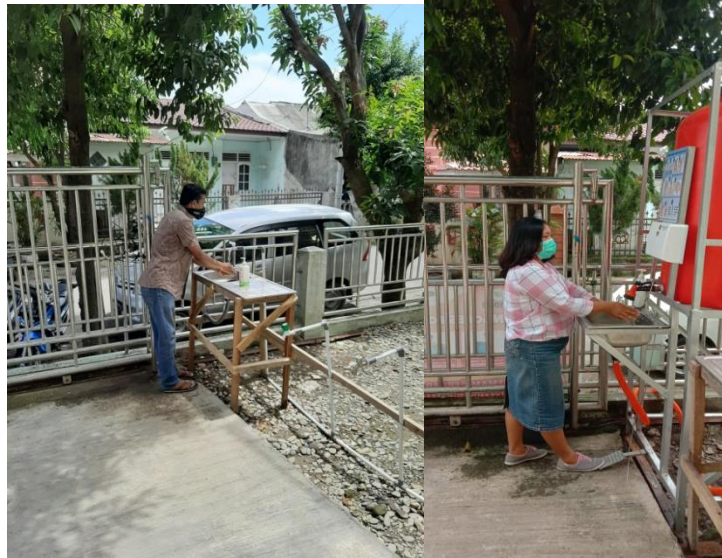
Figure 6. (Left) the condition of the previous wash basin (Right) A patient who is using hands free wash basin from community service activity.

pedal and it is correspondingly pulled by the applied force. As the tap control wire is being pulled which in turn the tap to open allowing the flow of water. After the user of the device has finished, then removes the foot to release the compressive force on the wire allowing the tap to return to close the valve stop flow of water.