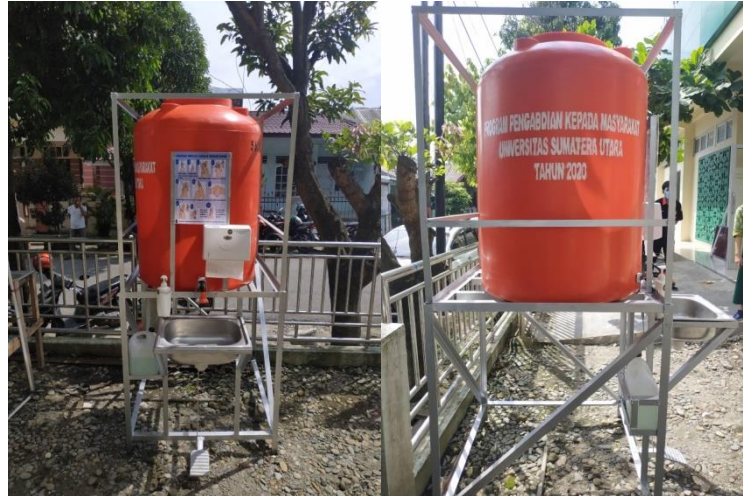
Figure 4. Front view of the hand wash basin handed over to the Simalingkar's Public Health Center.

sink without use, leave taps opened, water continues running and wasted. Or in the other way, user opens the tap and it make tap have remaining soap, after finished rinse hands well under clean water, sometimes needs to wash the tap handle and then have to re-wash hands. (Zaied, 2018).