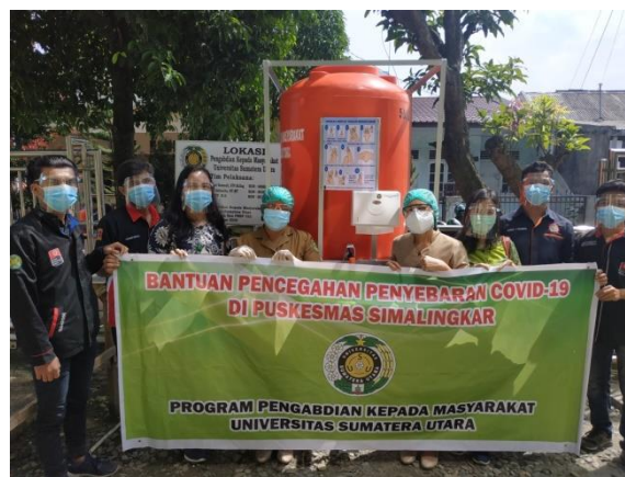
Figure 7. The academic team taking group photo with Partners when handing over hand washing equipment.

The success of this activity is patient who visit to Simalingkar's public health center feel more secure with the health protocol of prevention spread Covid-19 as seen in Fig 6 and medical staff remain enthusiastic to providing daily health services during the corona pandemic.