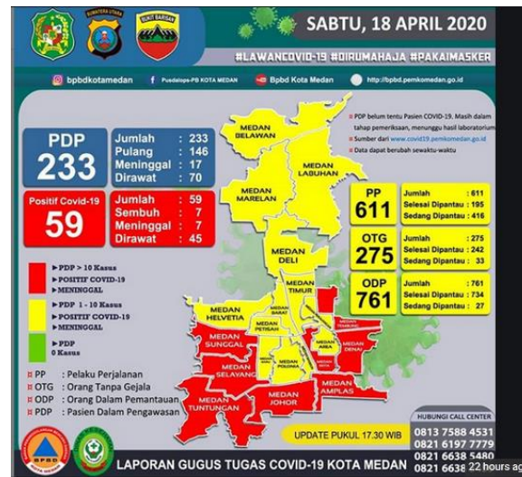
Figure 1. The spread of Covid-19 in Medan (Data on 18 April 2020)

From the data of the Medan City Task Force of Covid-19 shown in Fig 1 that Simalingkar Public Health Center (as Partner) which located in Medan Tuntungan District is one of 5 districts in Medan with red zone status. The other sub-districts with red zone status are Medan Johor, Medan Selayang, Medan Baru and Medan Sunggal districts (Febrianti, 2020; Fadhil, 2020).