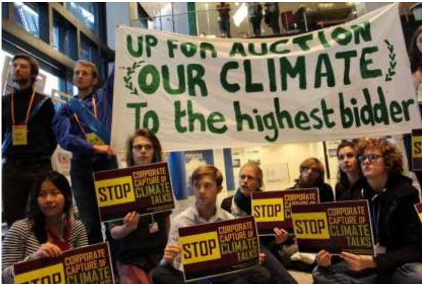
Photo 3: The climate auction for corporations