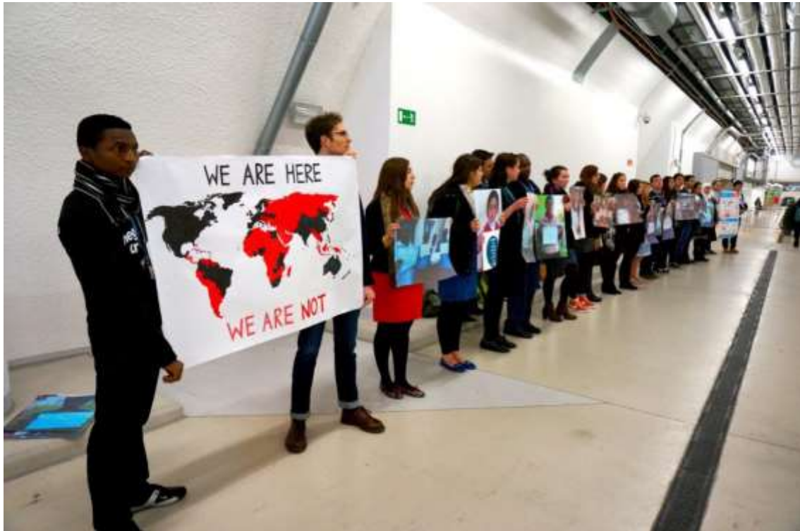
Photo 6: World map reading “WE ARE HERE/WE ARE NOT”

HERE/WE ARE NOT,” indicating that youth from the Global South were absent from the COP19.