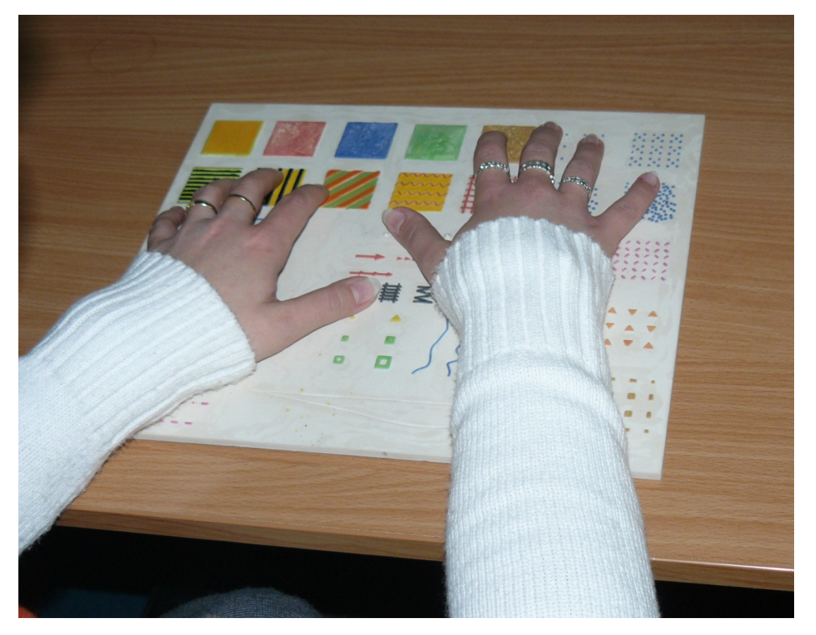
Figure 2 Testing board by the blind

In the above stated organizations, 80 % of blind persons and 20 % of persons with a severe visual debility from the selected number of respondents participated in the proposed testing, where a predominant group (75 %) of respondents were recruited from pupils and students of primary and secondary schools. The prevalence of tested individuals within school establishments was, according to our opinion, impacted by: