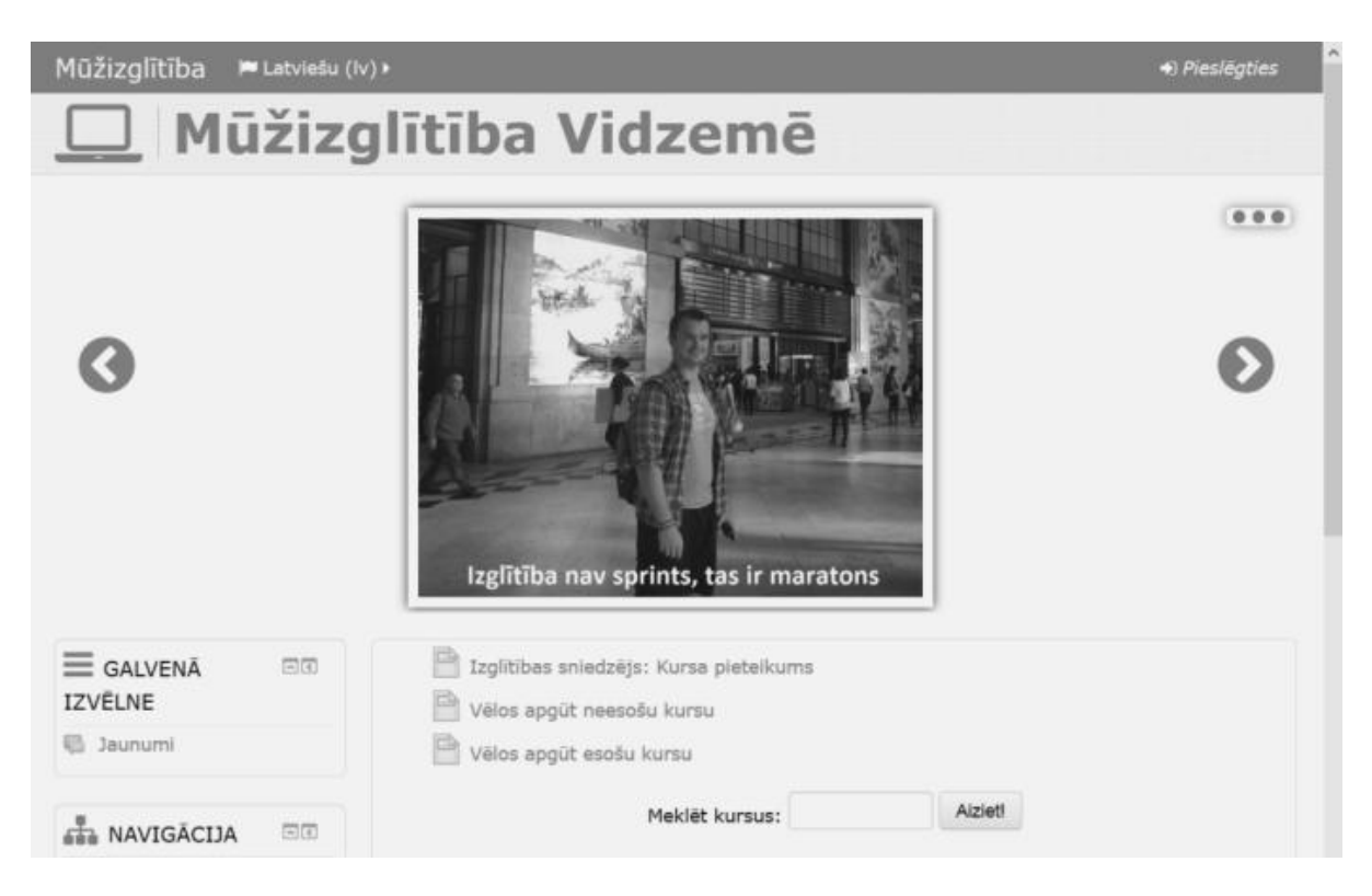
Figure 2 Prototype starting screenshot

With technologies constantly evolving, authors are debating another relationship, and that is between education and technology, as adults are getting used to new technologies and expect more flexible learning schemes. Optimal results cannot be reached by quantitative actions alone as long as the current processes and procedures of informatization are shape-shifting while sticking to the same old contents. Basic technological model prototype is focused for using on computer (Fig.2).