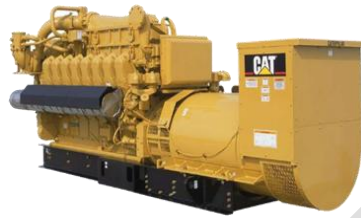
Figure 2. Caterpillar Internal Combustion Engine Generator [17]