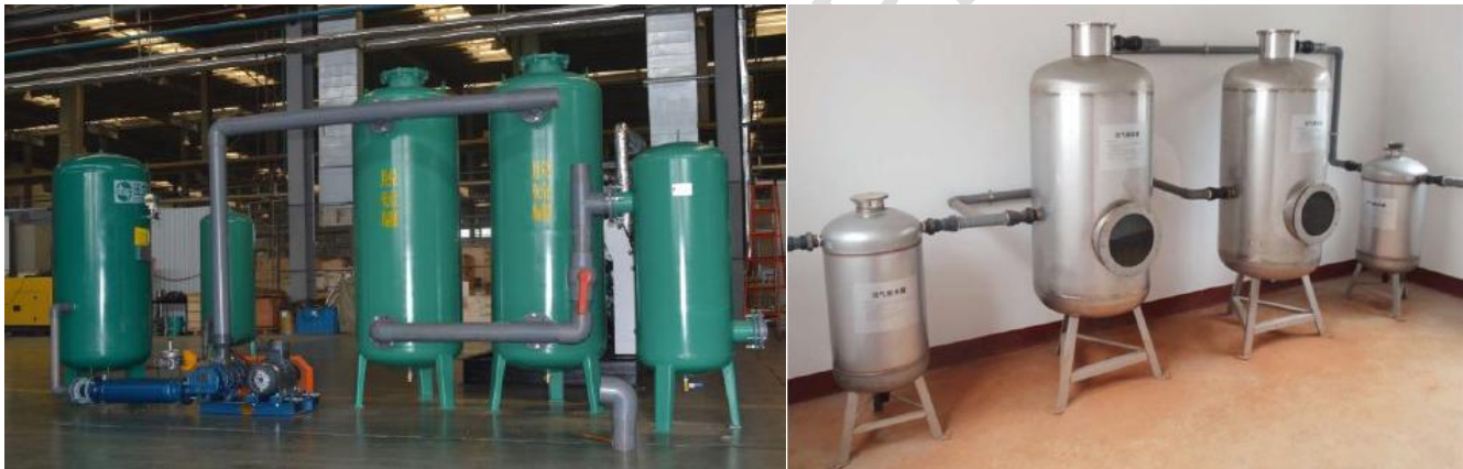
Figure 6. Filtering systems.

Biogas contains impurities and polluting gases that damage equipment if it is not filtered beforehand. It contains different pollutants such as hydrogen sulfide (H 2 S), halides and other silica compounds, as well as moisture, siloxanes and suspended particles that have to be reduced to guarantee a long useful life of the equipment. During the combustion process, hydrogen sulfide and halogenated compounds can form corrosive acids such as H 2 SO 4 (sulfuric acid), HCl (hydrochloric acid), and HF (hydrofluoric acid) that react with engine parts. Biogas always contains hydrogen sulfide, so it is regular to purchase a filter for this compound to avoid corrosion damage in the internal combustion engine [13].