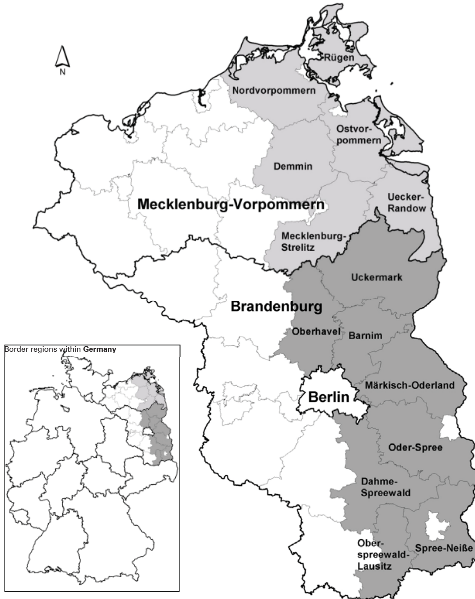
Fig. 2: Counties within the German Border Region