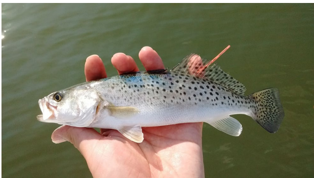
FIGURE 1 Spotted seatrout, Cynoscion nebulosus , on York River, Virginia.

The quality of the de novo-assembled spotted seatrout liver transcriptome was assessed using QAST and BUSCO. QAST indicated that this transcriptome contained 21,316 transcripts longer