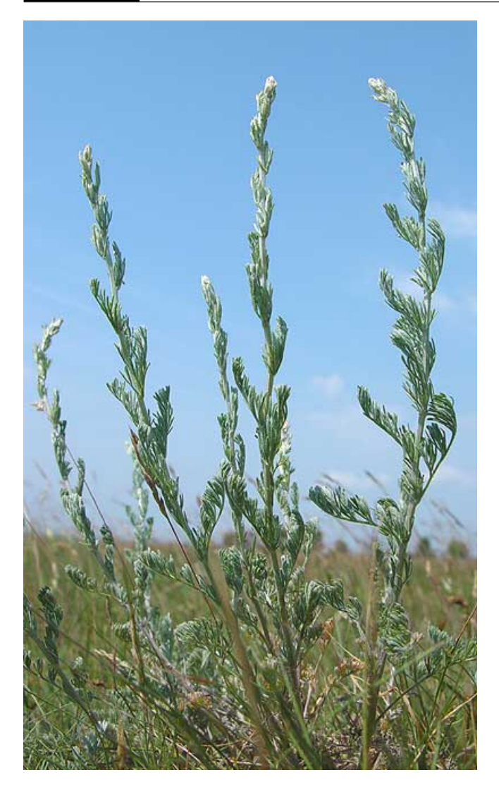
Fig. 1. Artemisia santonicum (Slano Kopovo, july 2016.)

et al., 2019). The aim of the present investigation was to determine the potential antifungal activity of the A. santonicum EO and of its individual component, isogeranic acid (IA) as a continuation of the previous work and antibacterial investigation (Stanković et al., 2019).