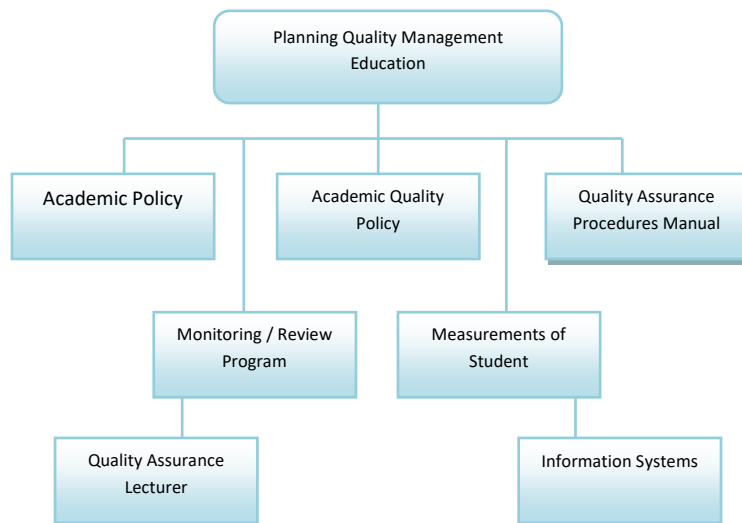
Figure 1. Planning Higher Education Quality Management at PTKINU

The Elements of planning process quality management above has been prepared by PTKI NU. Those elements were a standard for the delivery of internal quality management. Implementation of internal quality management was provision of quality management implementation. It was controlled by the existing units in three institute of Islamic higher education, namely the Quality Assurance Agency / Lembaga Penjamin Mutu (LPM). This model prefers the commitment of all stakeholders in the PTKI NU. It should be drawn up by the Faculty together with the Department.