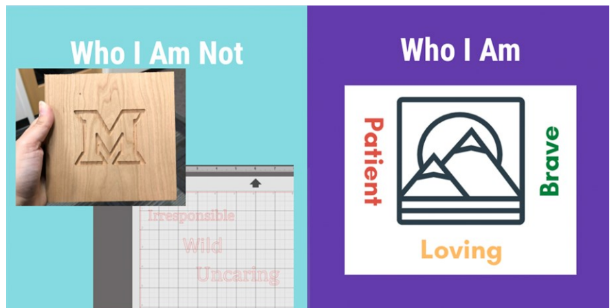
Figure 3: Example projects - “Who I Am Not,” a wood-block carved with the Miami University “M” logo and the words “Irresponsible, Wild, Uncaring” on the reverse, and “Who I Am,” a vinyl logo depicting mountains and the words “Patient, Loving, Brave.”