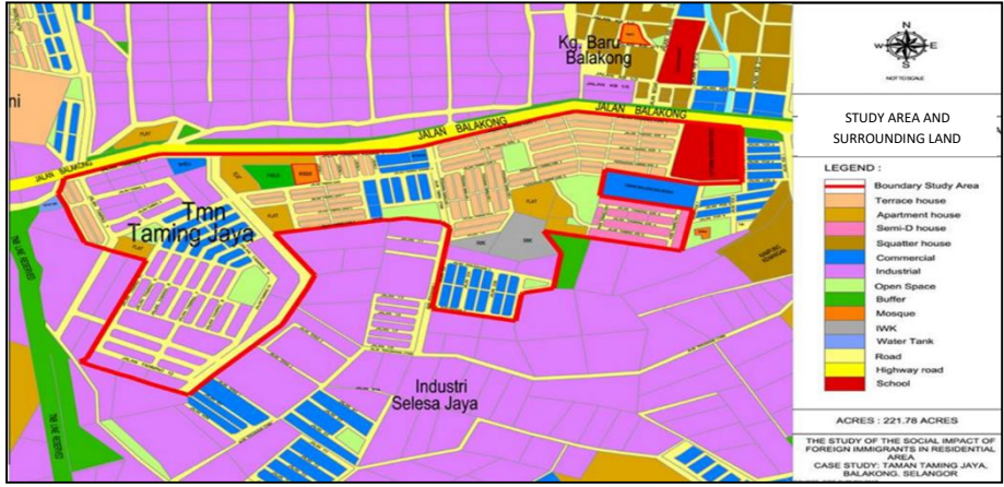
Fig. 1: Taman Taming Jaya and surrounding land uses

Taman Taming Jaya is located at Balakong within the administration of Kajang Municipal Council. It consists of 1,040 units of terrace houses, and twenty blocks of apartments in which each apartment has 150 units of houses (Kajang Municipal Council, 2016). The main surrounding land uses are the industrial and commercial area (Fig. 1). The study area is well connected with roads and public transportation networks. The study area is directly connected via major highways such as Lebuhraya Sungai Besi and Lebuhraya Cheras – Kajang. Serdang KTM Komuter is a commuter halt located in Serdang area and served by the Sungai Gadut - Tanjung Malim Route. The new Bus Rapid transportation also already operated across the study area. The nearest Bus Rapid station in Taman Taming Jaya is Bandar Tasik Selatan.