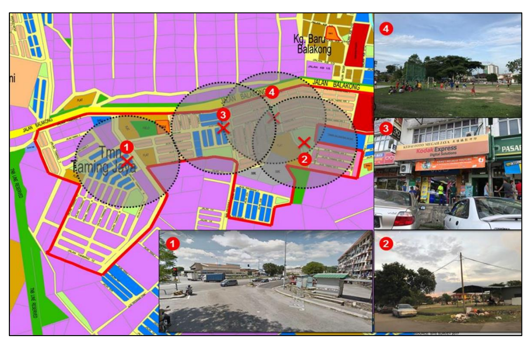
Fig. 3: The distribution of the foreigner gathering area based on observation in Taman Taming Jaya

Based on the observation that has been conducted at Taman Taming Jaya, several issues have been identified due to the presence of foreign immigrants in the study area. As shown in Fig. 3, most of the foreign immigrants were gathered in the commercial area (photo 1 and 3 in Fig. 3). This condition caused the locals to feel afraid to go to the area. This area was once monopolized by the locals but has turned into an area for foreign immigrants to gather especially during the weekends. Furthermore, the influx of foreign immigrants in residential and recreation areas (photo 2 and 4 in Fig. 3) had caused traffic congestion, particularly after working hours when the immigrants gathered at the entrance of housing and recreation areas.