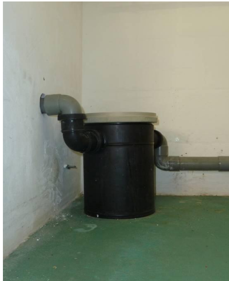
Typical waste water sample pit

The release of heavy metals and relevant inorganic emissions to the drain system is given in the table below. The measurements are performed by one external company for all the Petten site organisations at different locations.