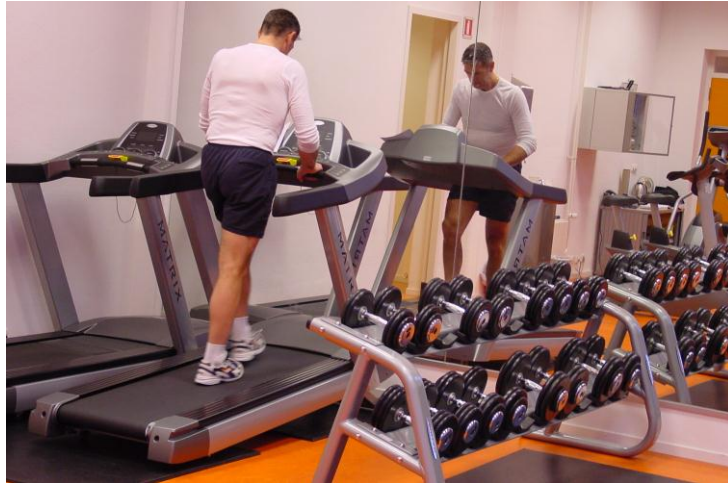
Gym facility at IE-Petten