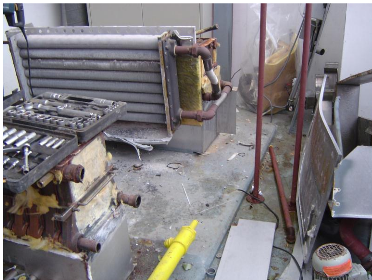
Improvements of the heating systems at the Institute

The current certification is granted by TNO Certification and dates from 19 March 2007. The certificate was in 2010 recognized by BSI after external audit.