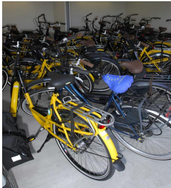
Zero emissions, environmentally friendly transport

In 2010 the institute acquired 20 service bikes for staff to be used on the terrain. These bikes can be used by staff during working hours as transportation between buildings or during lunch time to go to the forum restaurant. This initiative has been very successful and it is envisaged to develop the initiative further in 2011.