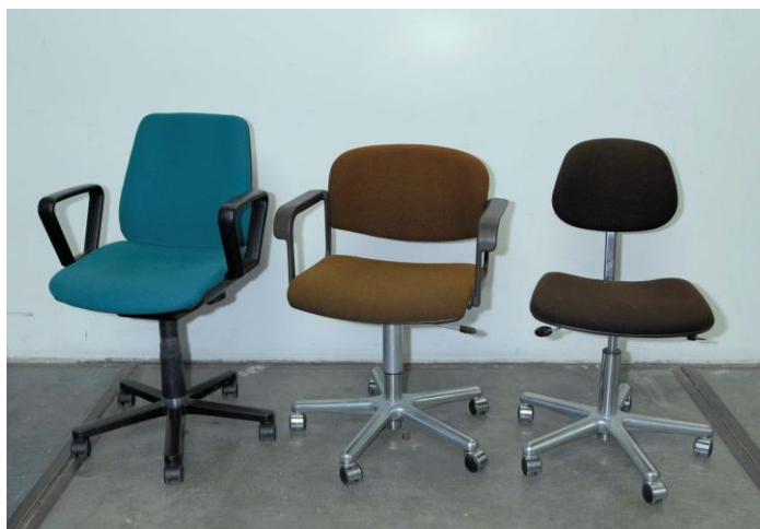
Improvement items on pc workplace ergonomics