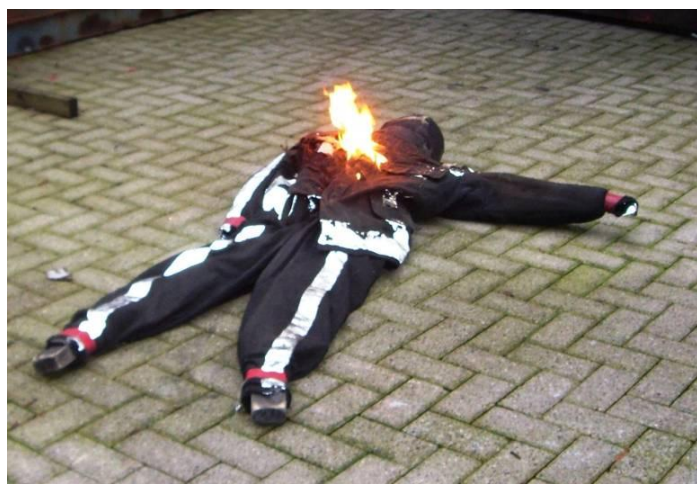
Training item for the JRC-IE in-company emergency response team.

At the level of the Petten research location, collaboration between the different companies and institutes on-site has taken place to prepare and execute site emergency exercises. Lessons learnt during this process are implemented in collaboration by all participants.