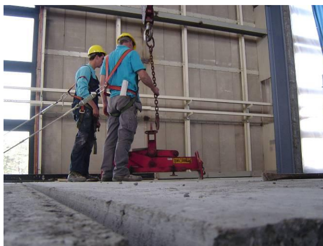
Example of working on height at JRC-IE for which a work permit is required.

The number of work permits per year has increased during the last years. It is clear that the majority of work permits are given to external companies. Since April 2008, notes are sent to the responsible unit head if work is performed for which the required work permit either was missing or was not complied with. There were 8 such instances in 2008 (April-December), 6 in 2009 and 6 in 2010 corresponding to 7%; 4% and 3% of the total number of work permits granted in the respective period, showing an increased compliance with the safety system.