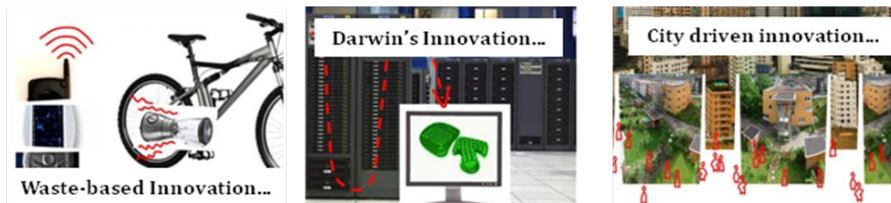
Figure 2: Three INFU Contrasted Visions

INFU is exploring the future of innovation in a bottom up approach (figure 1). In the first phase, all sorts of observations of striking innovation practices were collected in a loose and open manner. From these signals of change, 20 contrasted visions on the future of innovation were generated by clustering and “amplification” (figure 2). These provocative projections were discussed with actors with different perspectives on innovation patterns through interviews and an online survey. On the base of all reactions on the contrasted visions seven “nodes of change” were identified.