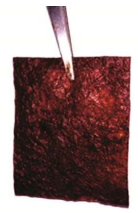
Fig. 2 — Tensile strength analysis of synthesized bioplastic

Fig. 3 represents the FTIR spectra of synthesized bioplastics. The dominant absorption peaks around