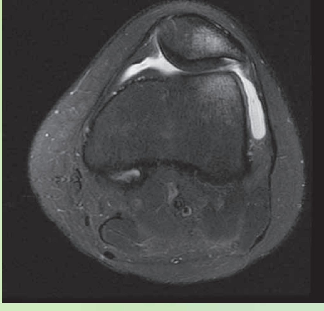
MRI Sept. 2018: New full thickness osteochondral defect in lateral facet of the patella and trochlea with small visualized loose body.