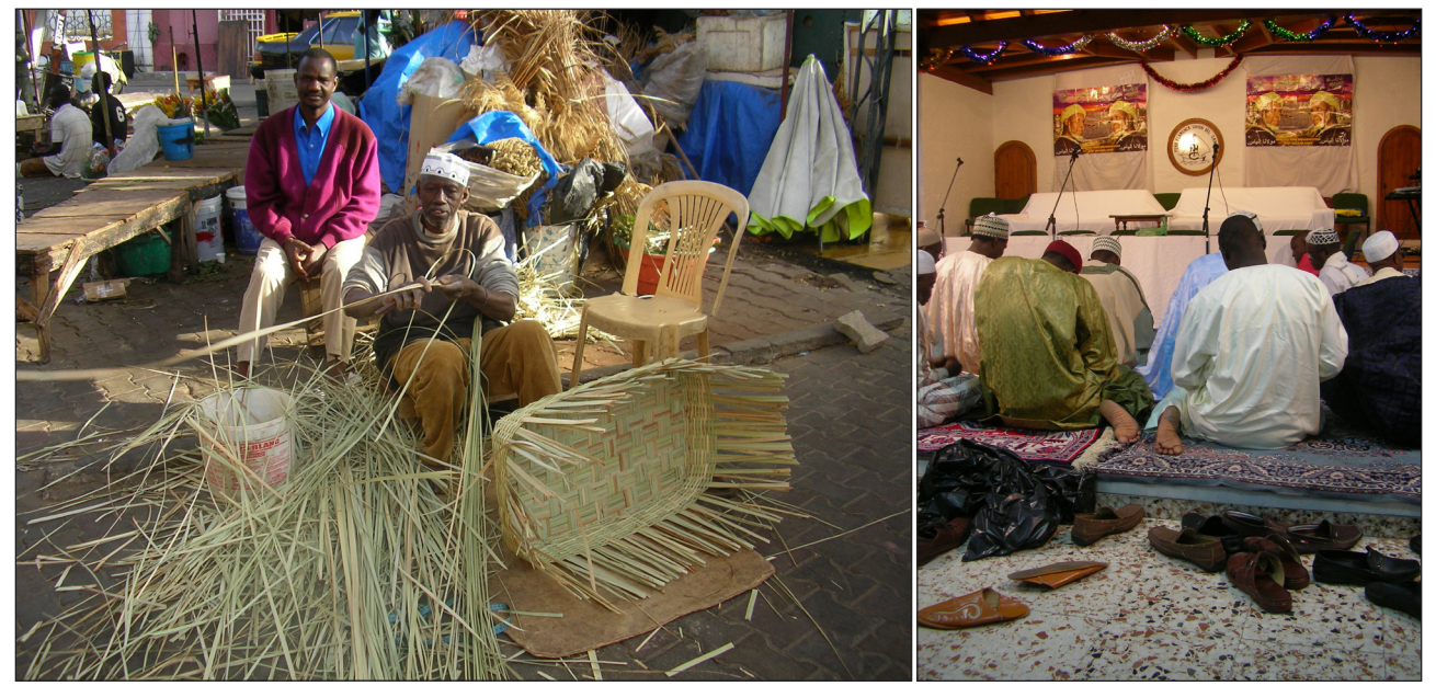
Photos 1 and 2 Left: Dakar-based migrants from Nguith making and selling baskets at a market in Dakar: an important source of income for generations; right: migrants from Nguith in Spain praying during the Gamou (Mawlid), the annual celebration of the prophet Mohammed's birthday