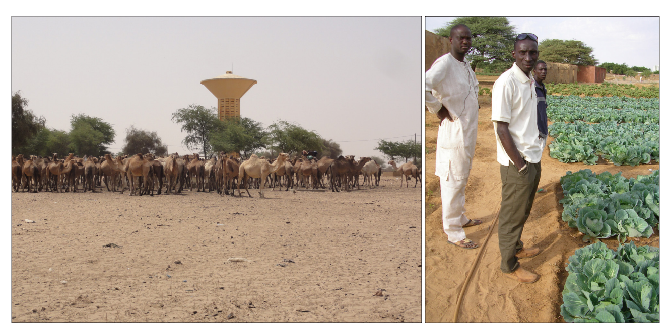
Photos 3 and 4 Left: a passing camel herd from Mauretania gathers around the deep well in Nguith contributing to visible soil degradation; right: returned migrants inspect a vegetable garden.