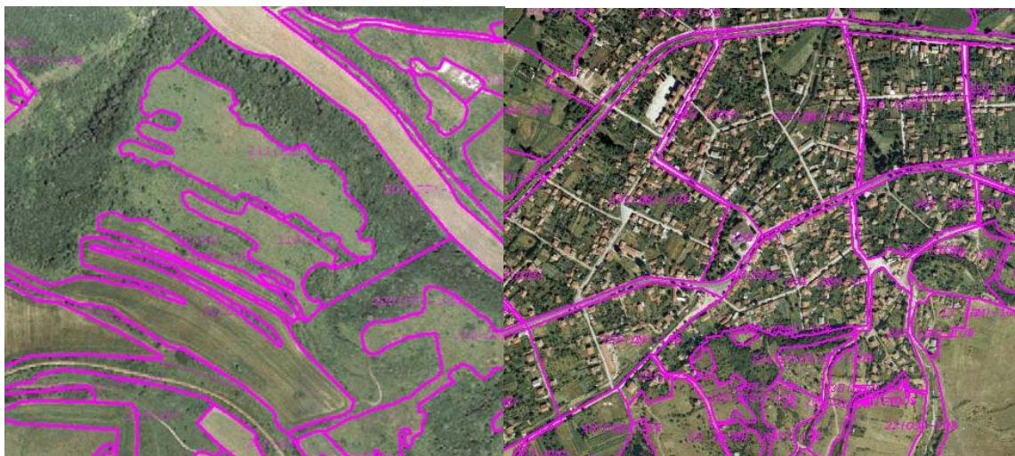
Figure 1. Examples of Physical Blocks in rural (left) and semi-urban areas (right).