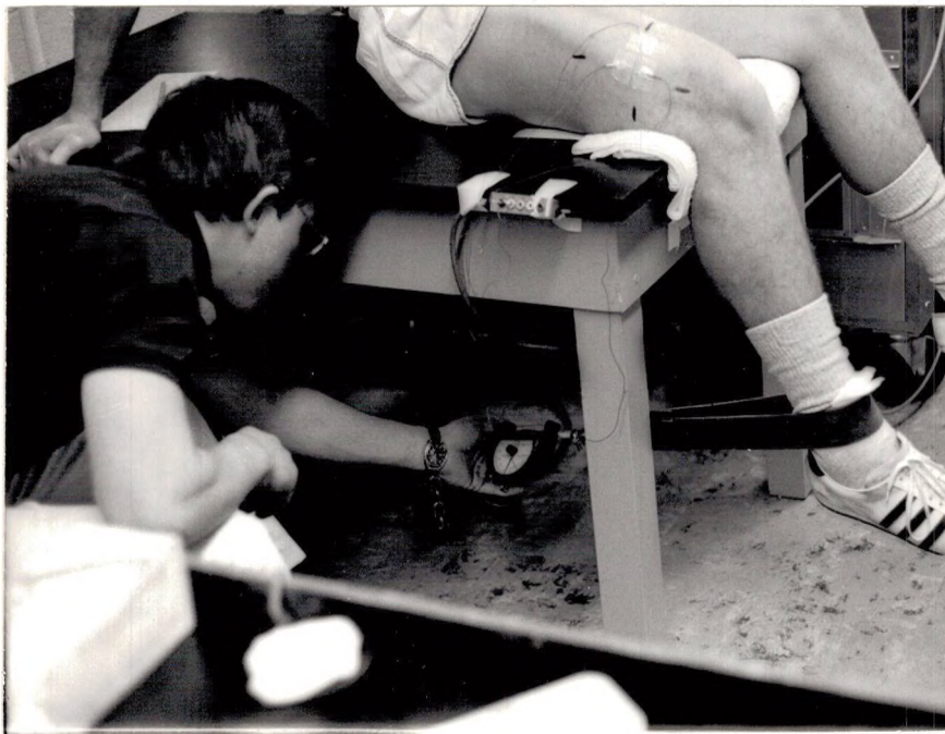
Fig. 2. Proper positioning of sling and tensiometer.