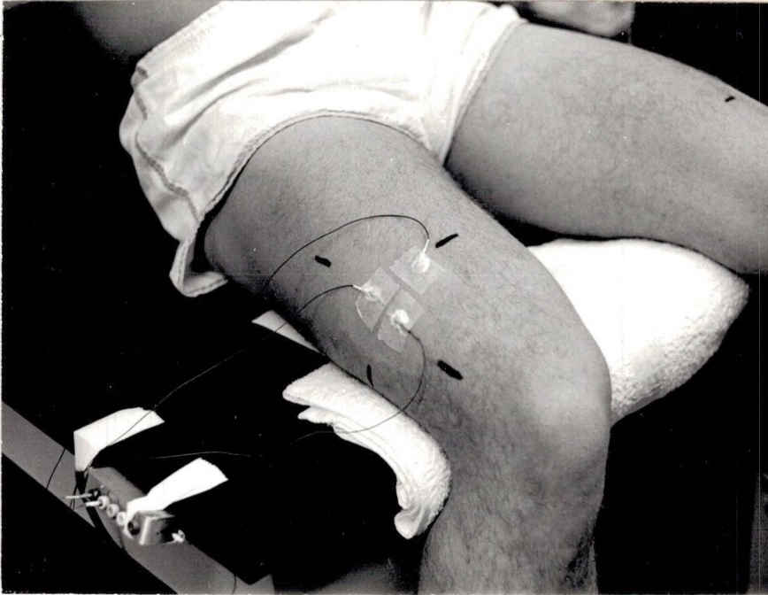
Fig. 1. Placement of electrodes.