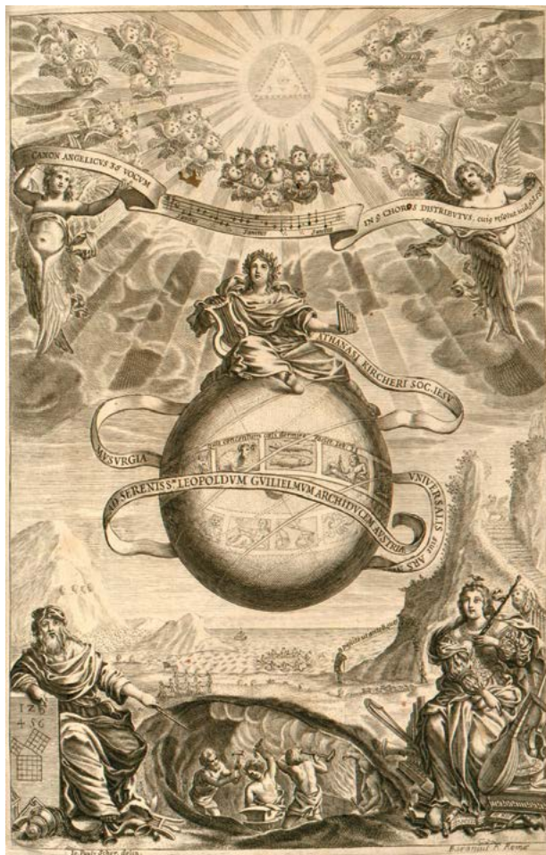
Figure 1. Frontispiece of Athanasius Kircher, Musurgia universalis (1650).

seventeenth centuries, the European Age of Encounter would also produce the potential for global musicological moments, the best known of which is probably Athanasius Kircher’s 1650 compendium of musical objects from the world, Musurgia universalis (see Figure 1). 23