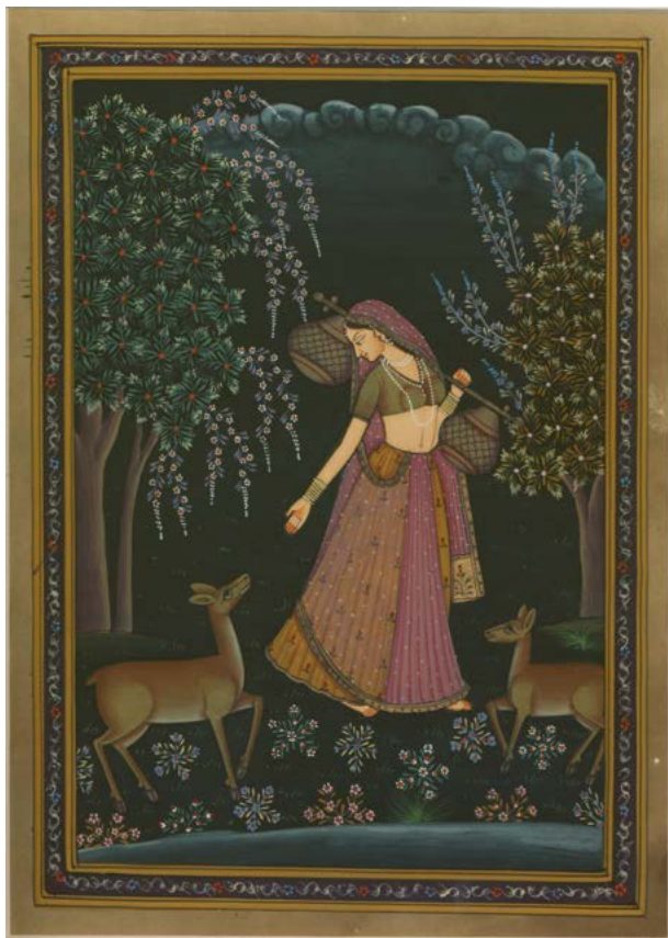
Figure 3. Rāgamāla Painting of Rāgini Todi. (Personal collection of Philip V. Bohlman)

The importance of rāga in that emerging global aesthetics should not be underestimated, and for that reason I make a brief excursion to Indian musical aesthetics that potentially allows us to reroute the intellectual history of music scholarship more generally. I turn, in fact, to one rāga, the many manifestations of which came to enter a new global musical aesthetics in the eighteenth century. I speak here of the rāga, or rāgini, Todi, for whom an aesthetic language coalesced in what we can understand as the Indian enlightenment. The aesthetic language used to express the ontological meanings of rāga encompasses a remarkable range of the arts, among them the religious narratives and visual designs of the tradition of miniature painting known as rāgamāla (see Figure 3).