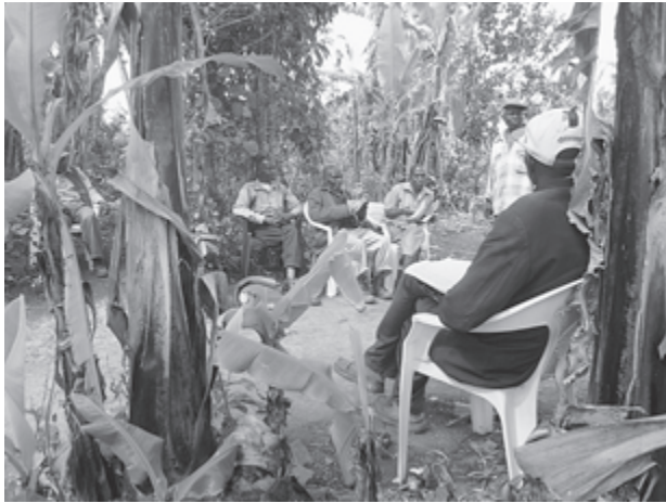
Figure 2. Athimba clan meeting on 3 September 2015