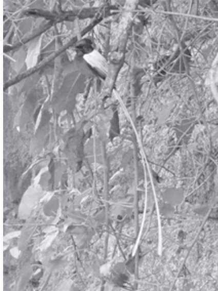
Figure 1. A kanyîrî