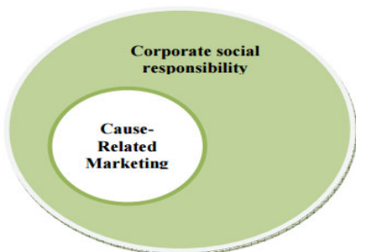
Figure 1: CRM is a part of social responsibility (Anghel)

The very first attempt to market for a cause or to initiate a CRM campaign was done by The American Express Corporate back in 1983. The corporate at that time have raised funds for the preservation of the statue of liberty. In no more than 4 months, the corporate managed to raise $1.75 million for that cause and its benefits went up to 28% (Laszlo & Lyons, 2014).