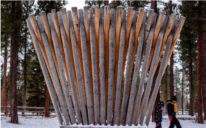
Figure 2. Casey Schachner, Stringer, 2017, BPSW, lodgepole pine, steel, 30' x 17' x 10'