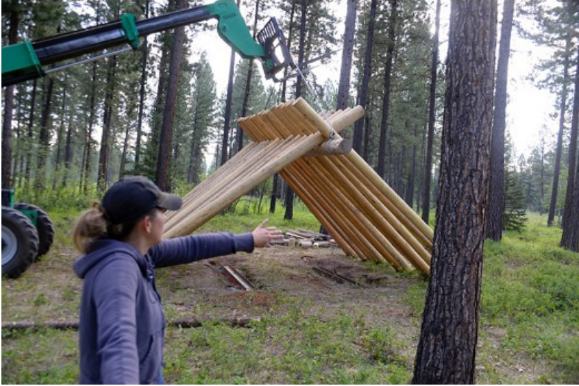
Figure 1. Casey Schachner directing the install of Stringer, her large-scale, site-specific artwork at Blackfoot Pathways: Sculpture in the Wild (BPSW)