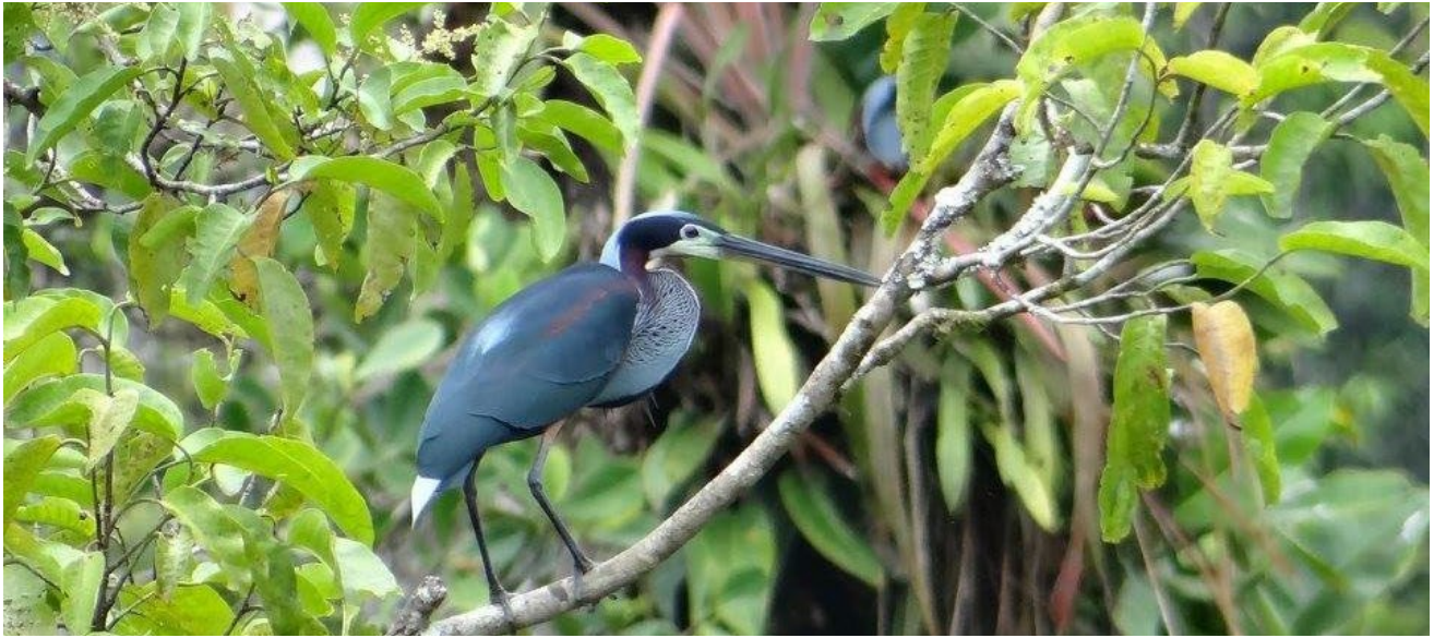
Figure 2. Agami Heron ( Agamia agami ), in Tambococha, Yasuní National Park, Ecuador.

The nesting colony of Agamia agami is found in Tambococha, Yasuní National Park ( 1^{\circ}5''11''\text{S} , 75^{\circ}33'42''\text{W} , 130 m). The nesting area is approximately 2 ha, and the nests are located together between 2 and 3 meters above water level (Figure 3).