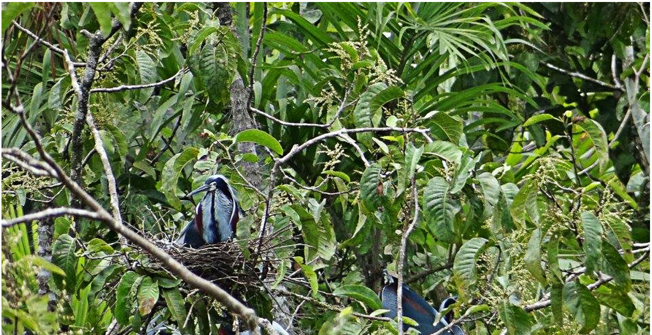
Figure 3. Nesting area of Agami Heron ( Agamia agami ) in the Amazon Rainforest, Tambococha, Yasuní National Park, Ecuador.

Seventy nests were recorded, with at least one adult sitting on each, as if they were incubating, and some other adults were observed carrying thin branches to build the nest. Up to March 2017, no eggs were seen in the nests.